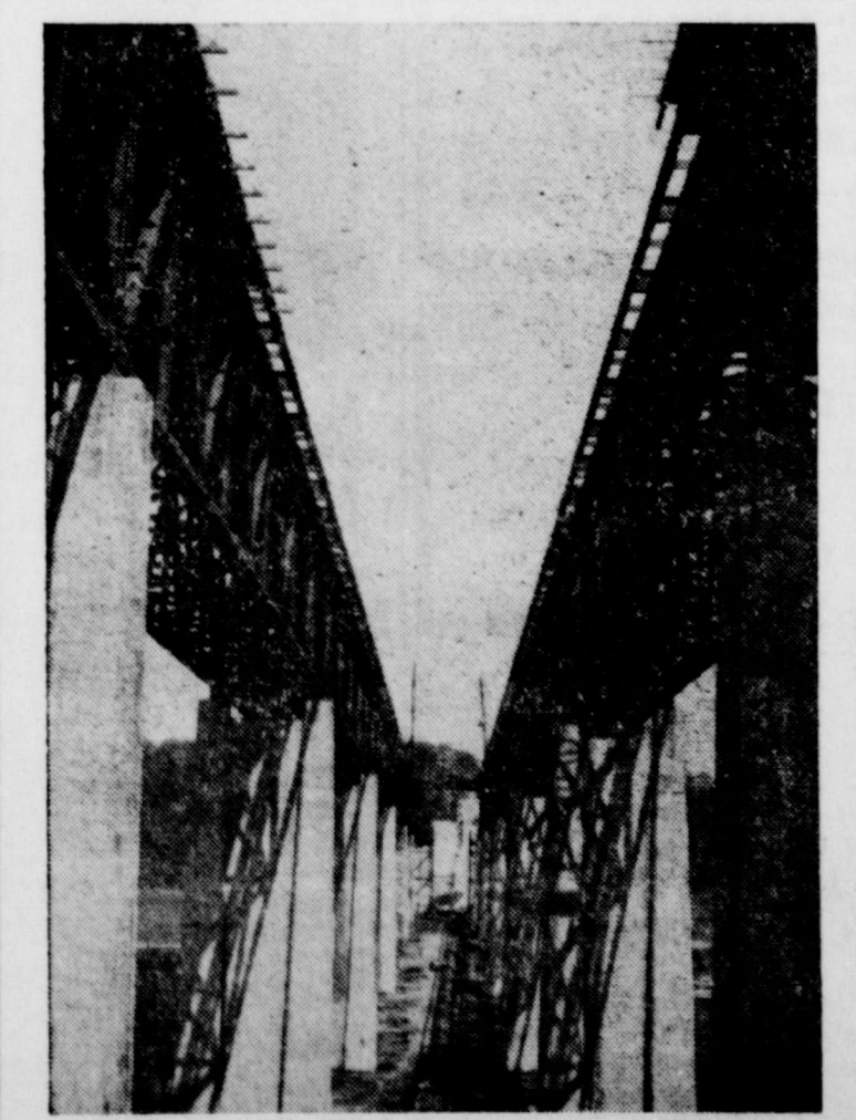
SOME TIME NEXT YEAR-Concrete, steel and sky make an interesting contrast as these two bridges are constructed over the Cuyahoga Valley at Peninsula, O. The twin spans are part of the new turnpike being built across Ohio. One end of the 241-mile stretch is connected to the Pennsylvania Turnpike, and the other ends in a pasture at the Indiana border. The $326,000,-000 project is scheduled for completion on November 1, 1955.