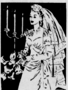
WANT HER TO KNOW YOUR LOVE IS WITH HER, TOO?

Approximately twenty four guests attended.