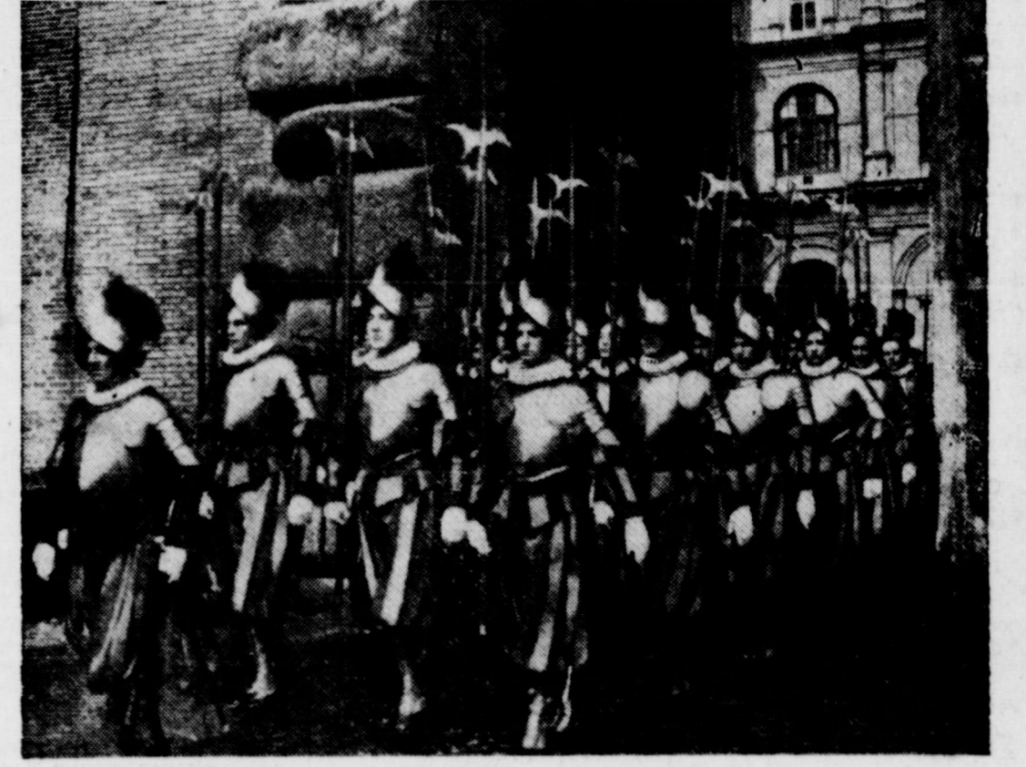
NEW BLOOD FOR OLD GUARD —New members of the famed Swiss Guard at Vatican City are marching into the courtyard to take the oath of allegiance. This year 17 new men were added, bringing the full strength to 95. The picturesque Papal guard was founded in 1505 by Pope Julius II, who chose the Swiss as the best soldiers of that time.