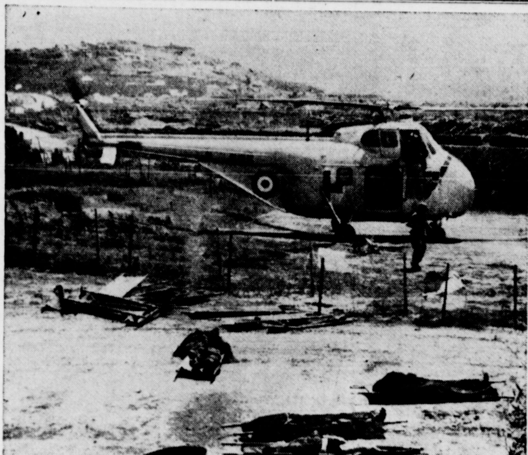
BRINGING THEM OUT—The first 16 of the gravely wounded French Union soldiers who fell at Dien Bien Phu flew from the shambles of that fortress to freedom. They were the vanguard of 540 Franco-Viet Nam soldiers so gravely wounded in the siege of the fallen bastion that the Communists agreed to permit the French to use helicopters to evacuate them to hospitals.

Let Your Bank Be Bookkeeper 197. NAT'L in Cisco—Mr. F. D. I. C. BANK BY MAIL AND SAVE TIME