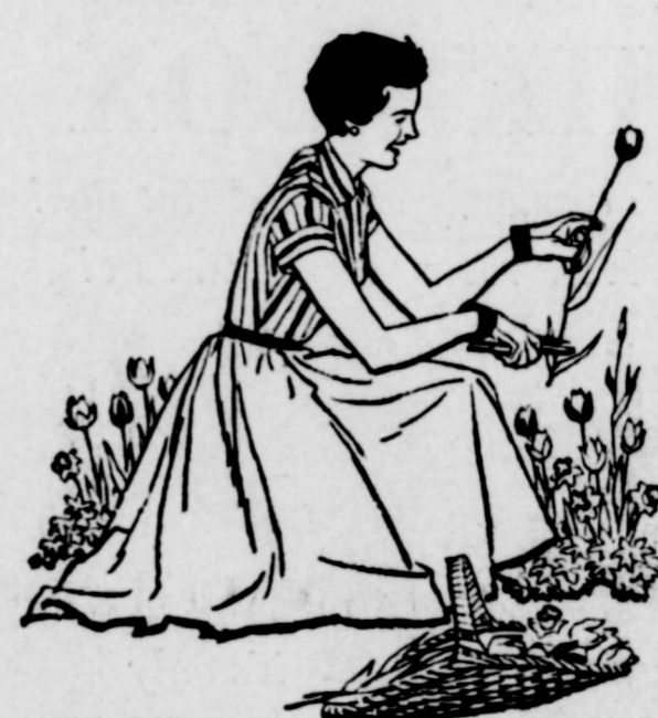
She's doing the laundry — her automatic electric washer and dryer have taken charge.

* DO TWO THINGS AT ONCE WHEN YOU LIVE ELECTRICALLY!