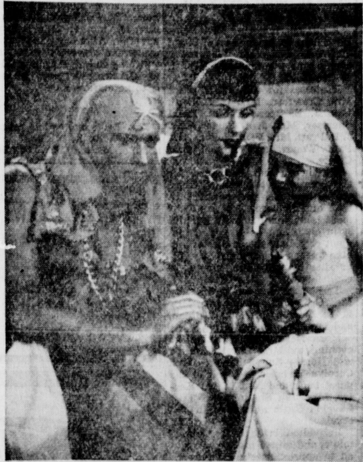
Shown above is a scene from "Joseph and His Brothers," which opens Saturday at the Palace Theater and Wednesday at the Joy Drive In. Filmed in color, the picture is expected to attract considerable interest. The local showing will be the first in Texas for the new religious film.