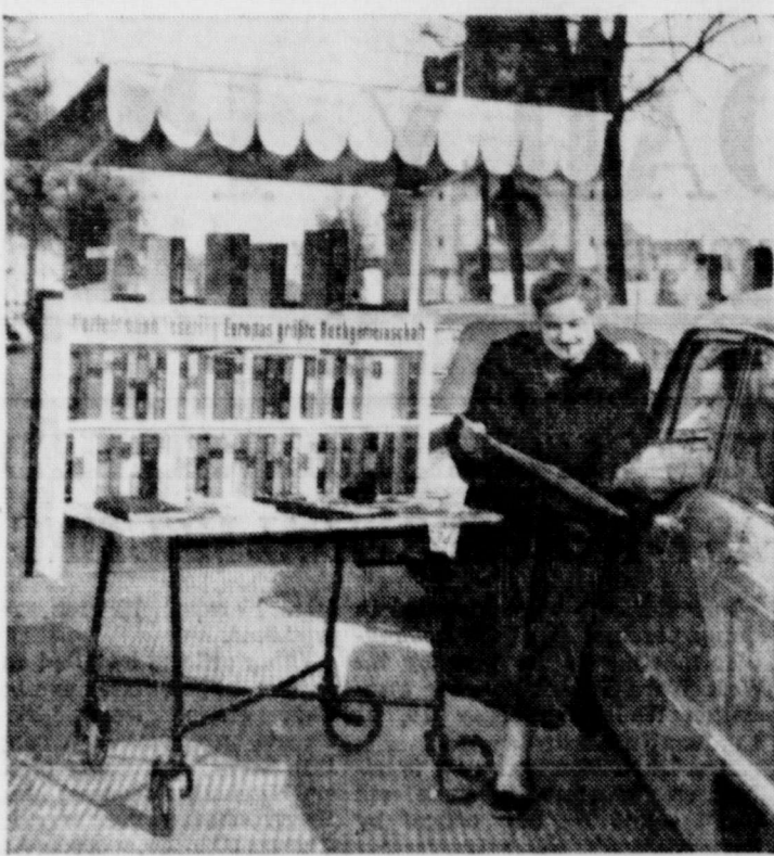
MIGHTY HANDY—An enterprising book seller in Berlin, Germany, is attracting some four-wheeled trade on the city streets. With her shop on wheels, the proprietor is able to show her entire stock to a customer without the prospective buyer having to climb from behind the wheel of his car.

The world's first completely air-conditioned village takes its place on the map of Texas June 2, as a private industry research project to determine the effect of manufactured weather on a budget, health and home life of American families.