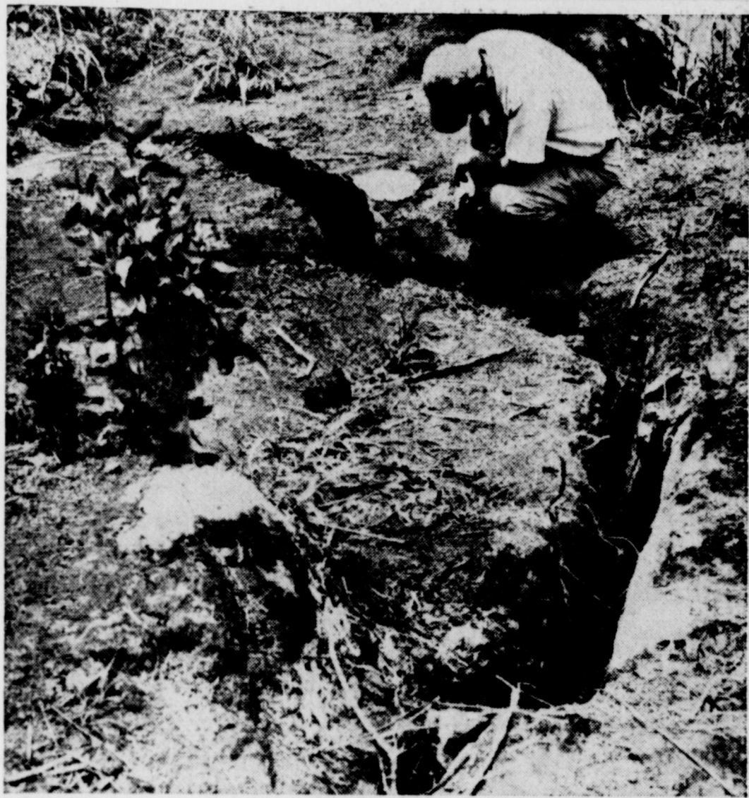
THREAT IN PANAMA —A surveyor is checking a deep crack which threatens to open wider and cause a landslide which might block the Panama Canal. The 600-foot-deep crack is in a rock ledge overlooking the canal in the famed Gaillard Cut. First noticed some years ago, the crack has been widening recently and the rainy season could create a real avalanche.