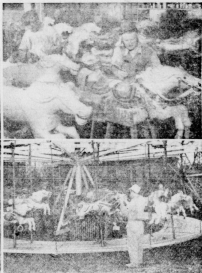
have only 20 or 30 horses. Two employees of the Parker Amusement Company are shown, top right, putting the finishing painting touches to some of the horses. Below, workmen check stirrups and bridles during the trial run of a new carousel. A canvas top will be added before it's ready for delivery.