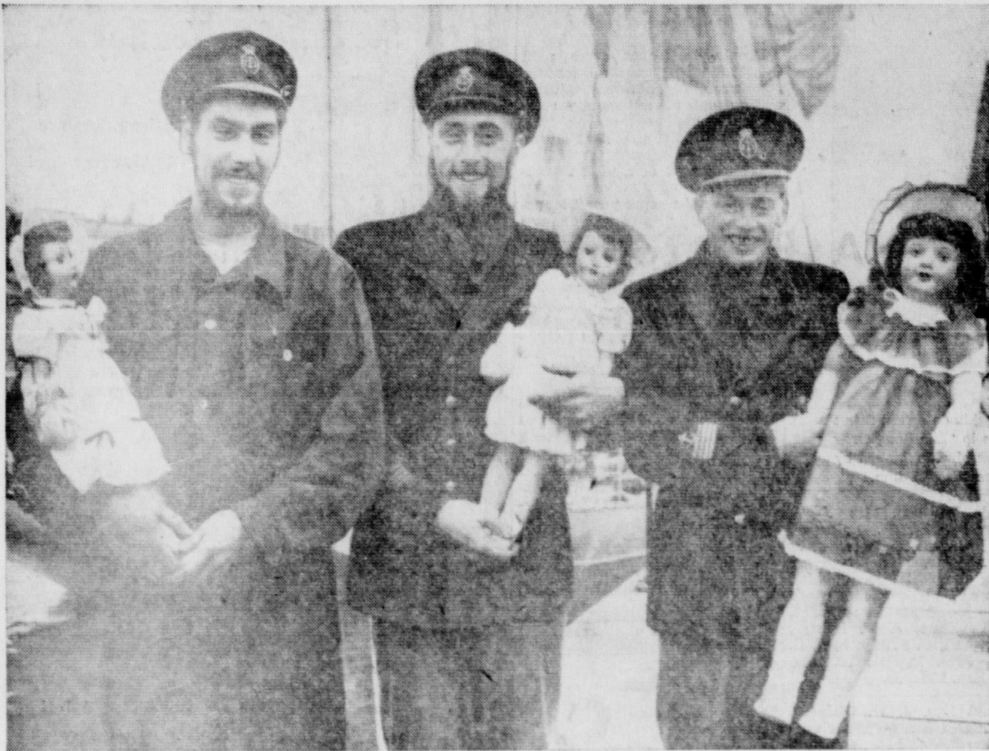
GOBS AND DOLLS—Smiling members of the crew of the Swedish naval training schooner, Falken, carried these big dolls when they arrived in Southampton, England. The "gals" are souvenirs of the sailors' cruise to the West Indies.