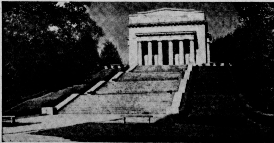
OLD KENTUCKY HOME—The log cabin where Abraham Lincoln was born is encased in this shrine in the Abraham Lincoln National Historical Park at Hodgenville. The White House has announced that President Eisenhower will make a visit to the shrine very soon.