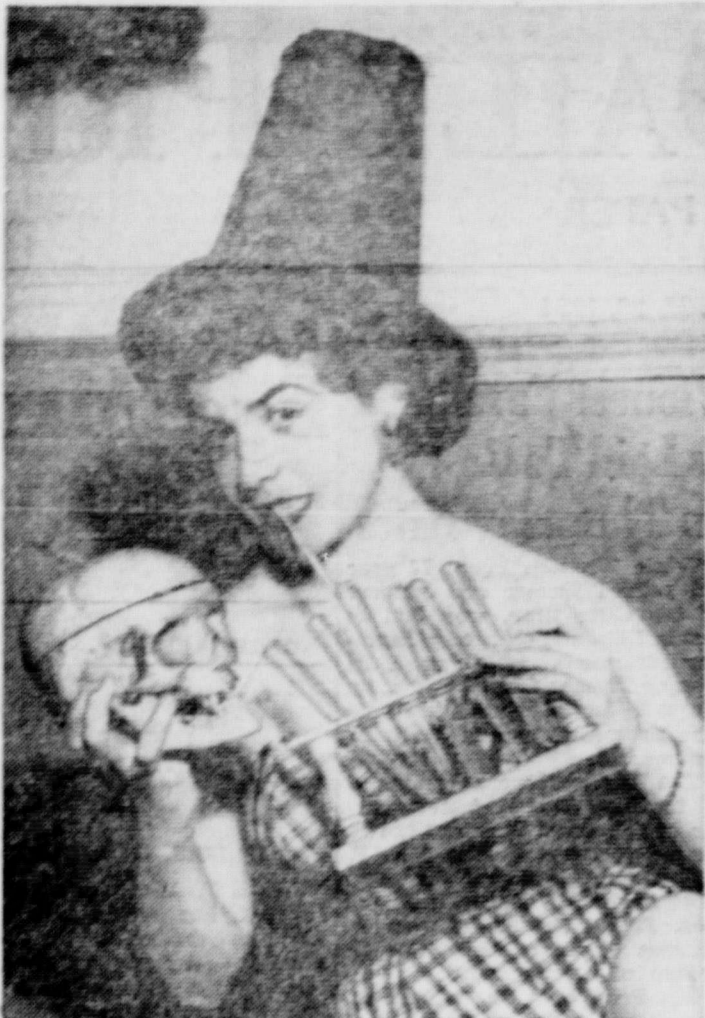
BEAUTY AND—?—When she was named "Miss Quinine of 1934" by fellow chemistry students in Paris, this young lady struck up a terrifying pose. The skull added a gruesome touch to the grim festivities, but it's doubtful she's sipping quinine.