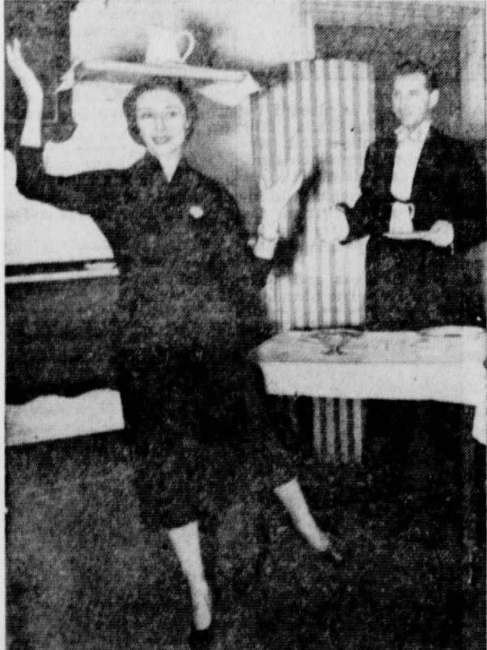
GOING TO HER HEAD—Ballerina Alicia Markova is demonstrating her excellent control as she balances a tray on her head to show the importance of coordination in ballet dancing in London. Admiring her performance is a waiter who knows he could save himself a lot of trouble if he could do that.