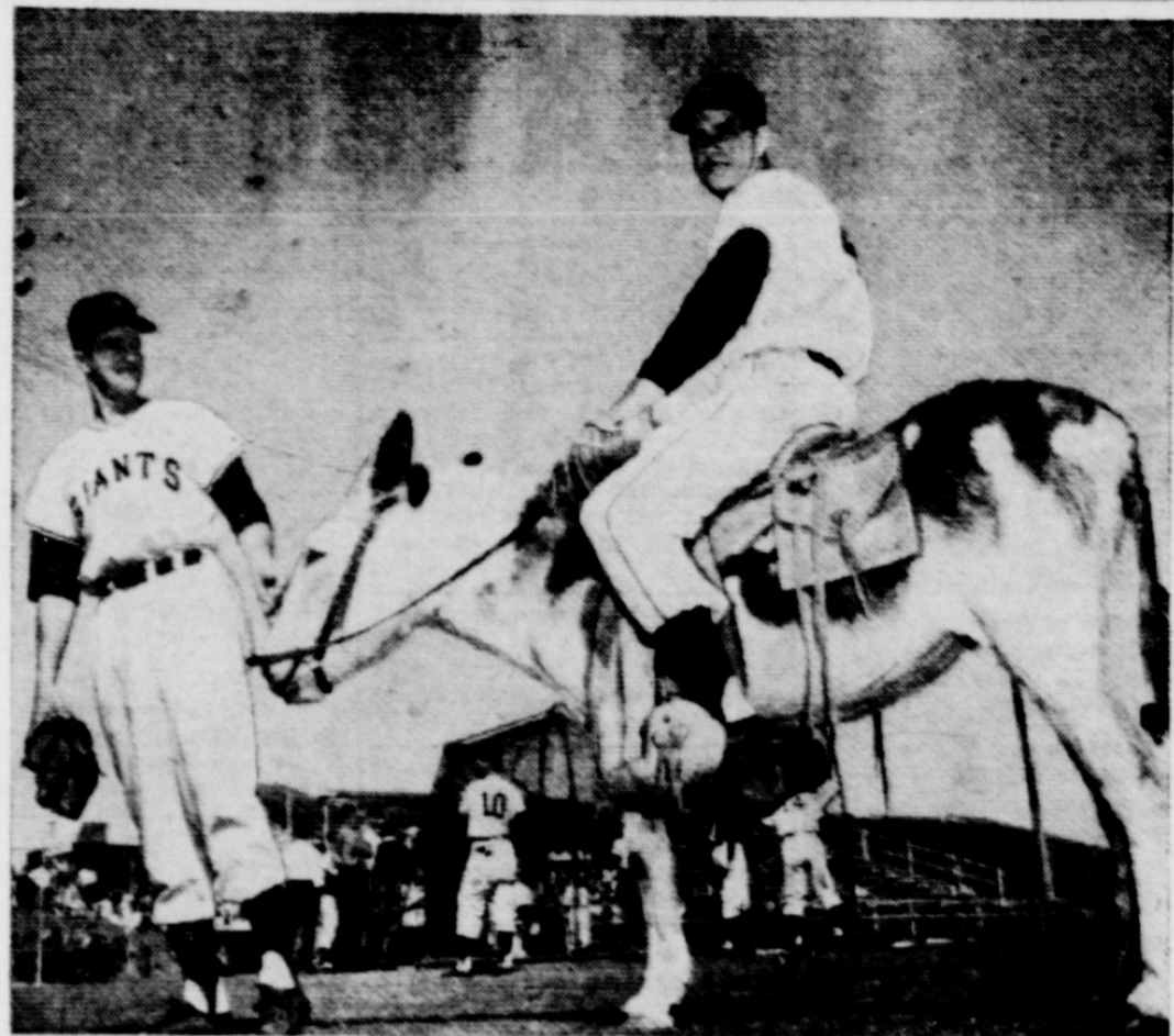
HOLDING HIS OWN—Barfly, a burrow, is proving he can be just as stubborn as a mule. Giant outfielder Don Mueller, left, is trying to set the animal in motion to give relief hurler, Hoyt Wilhelm, a ride in Phoenix, Ariz. This cutting up took place during spring training.