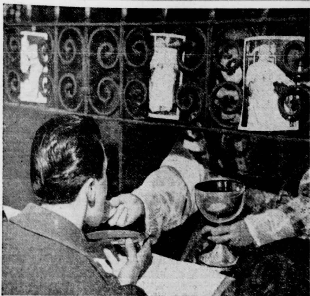
FOR THE POPE —During a special Mass in Rome for the recovery of Pope Pius XII, a priest serves Communion through a railing in Vatican City which is decorated with pictures of His Holiness. The Mass was held outdoors, where thousands pray daily for the Pope to get well.