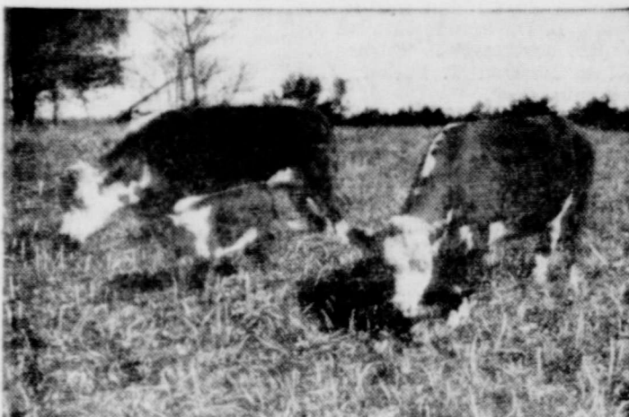
Herefords feeding on Ladino-tall fescue pasture, another valuable mixture in many locations is bromegrass, Ranger alfalfa and Ladino clover.

Ladino is the giant of white clovers ranking in productivity at or near the top as a pasture legume. Where adapted, no better pasture can be had than a compatible grass-Ladino mixture. Ladino, an aristocrat among legumes, requires fertile soil and extra feeding. A productive soil with adequate fertilization and lime, inoculation of the seed with effective nitrogen-fixing bacteria, and proper management of the crop, are necessary for maximum yields. When properly fertilized, Ladino has shown amazing ability to resist ordinary droughts. It always has a quick come-back when rains come.