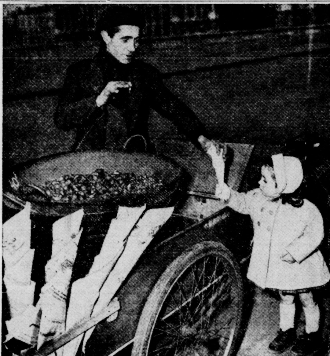
WINTER REFRESHMENTS —A tiny young miss was attracted by the cry of the roasted-chestnut vendor on a bridge in Paris. That meant mamma had to stop and make a warm purchase but perhaps she shared it with her daughter in an effort to help ward off the piercing cold weather.