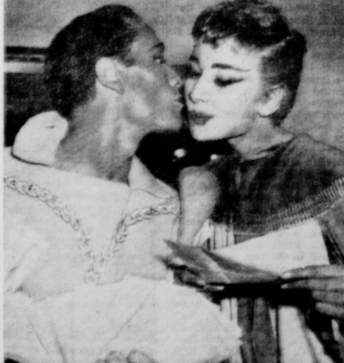
ONE FOR LUCK—After the opening night of "Ondine," the play in which they are co-starring in New York, Audrey Hepburn got a kiss of congratulation from actor Mel Ferrer. If good luck could be conveyed by telegrams, it would appear that "Ondine"