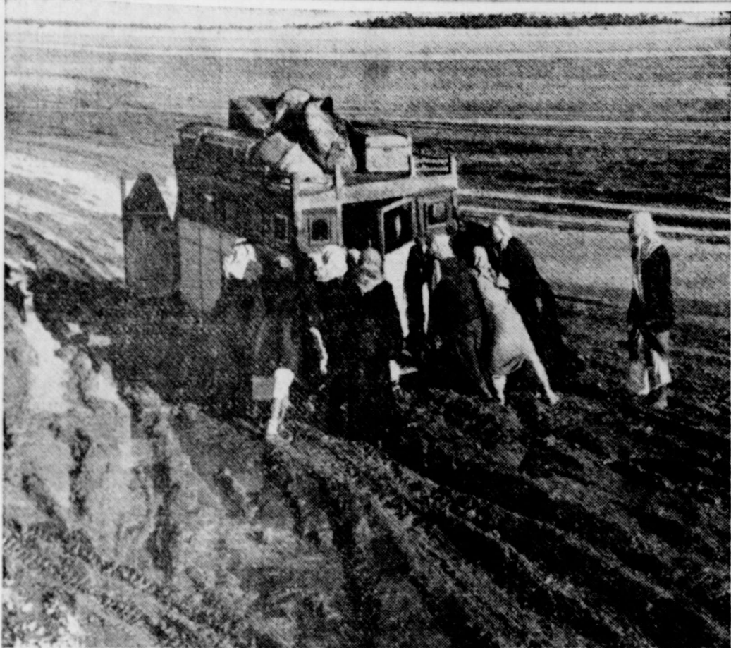
TRouble ALONG THE WAY—As winter weather plagues a lot of the world, the desert kingdom of Saudi Arabia has its difficulties, too. After a rare 48-hour rain brought almost a foot of water to Ras Tanura, these passengers in a bus got out to push their stalled vehicle.