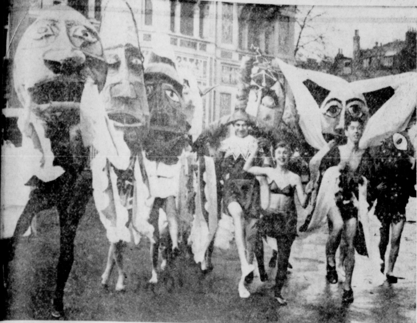
WHAT HAVE WE HERE?—Why, if it isn't some art school students having themselves a gay old time as they arrive at the Royal Albert Hall in London. They're really getting set for a rehearsal of a ball, and they're apparently having a ball doing it. Their costumes supposedly represent something in tales and folklore of a medieval German jester.