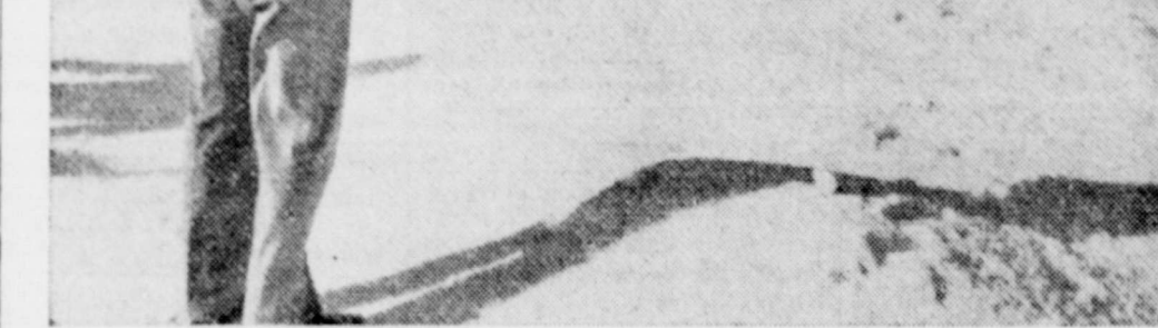
THE KNOCK-If it's true that opportunity knocks only once, these residents of Naples, Italy, seized their chance. For the first time in years, snow fell on the slopes of Mount Vesuvius and local residents got right out and made the most of it.