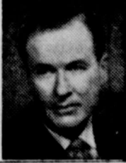
OMAR BURLESON Congressman 17th District

It is, of course, always a happy time when I can return home. In the first place, it is good just to get out of Washington. City life is not for me and, in fact, I could not be happy in any city unless I was exceedingly busy, which is always the case in the Capital.