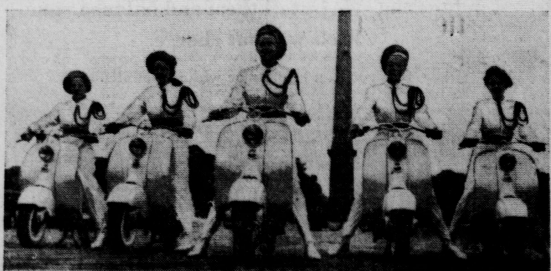
PRETTY GUARDS —A special squadron of motorized policewomen was on hand in Paris for escort duty when celebrities arrived in the French capital for a festival. The occasion honored the French 2nd Armored Division veterans of World War II.

Full information and application forms may be obtained from Sam B. King at the Cisco Post Office.