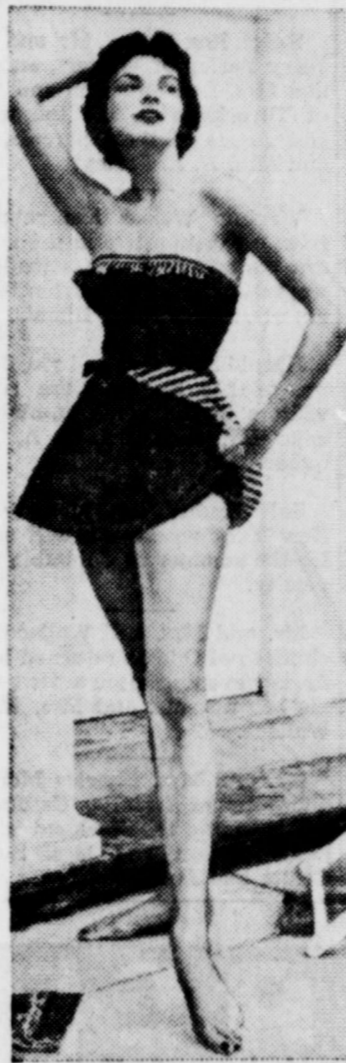
SEALED UP —During a ceremony marking Ohio's Sesqui-Centennial in Sandusky, this swimsuit was sealed away for 50 years in a time capsule on the courthouse lawn. Done in black cotton-broadcloth, the suit has bold black and white stripes lining the apron-overskirt and peeking through the bodice for an unusual effect.

The bride is a graduate of Cisco High School and Cisco Junior College and has been employed by the E. P. Crawford Agency. The groom is a graduate of Carrizozo High School and attended Cisco Junior College before entering the service.