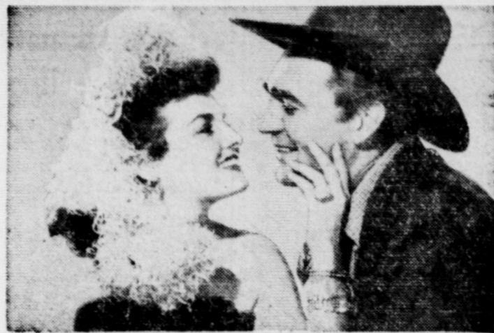
JANE RUSSELL teases FORREST TUCKER in this scene from RKO's "MONTANA BELLE," in Trucolor