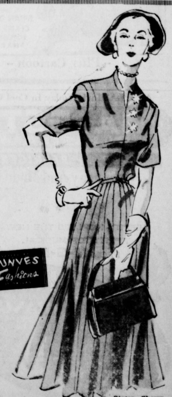
Styles Shown Dark Sheers $10.95