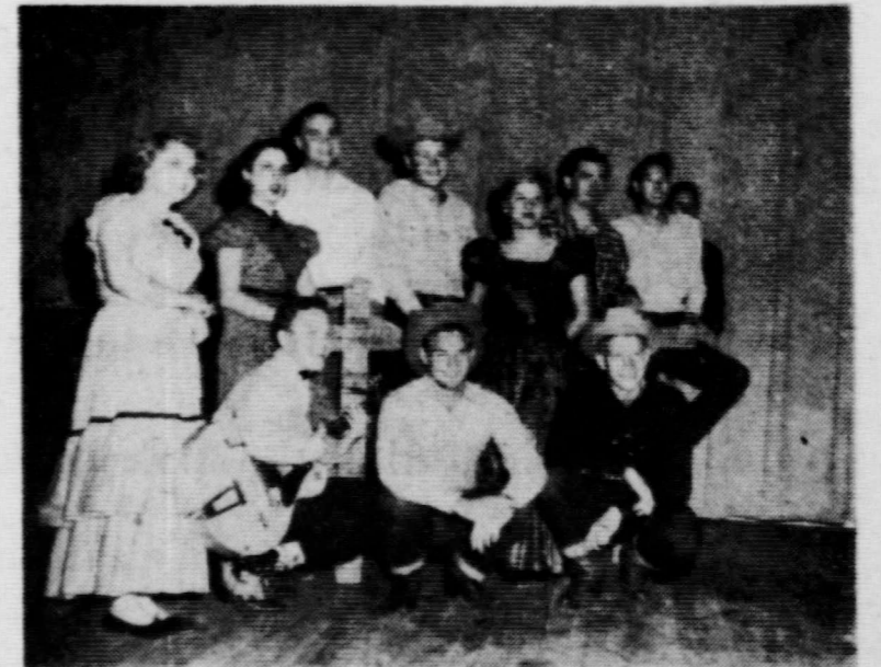
TYPICAL RANCH DAY SCENE

We thank the people of Cisco and the area for your fine support of our program. We have grown to know that we can depend on you to help when needed. — THANKS