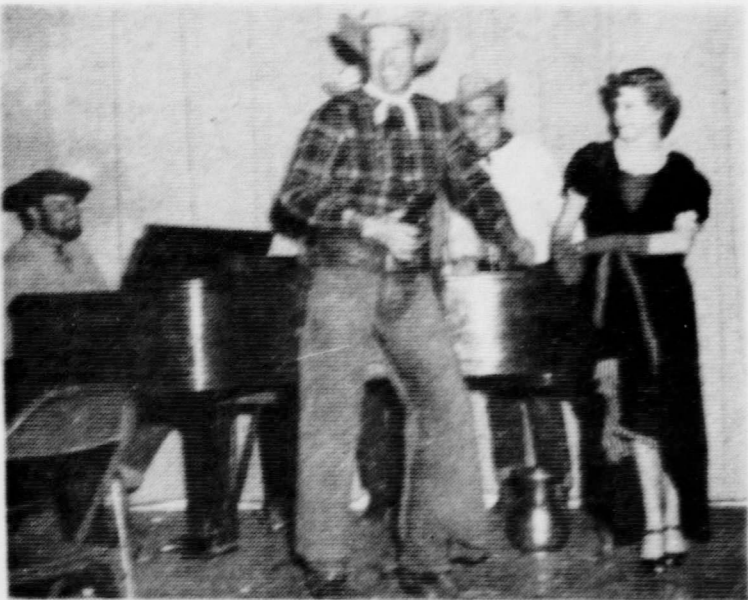
TYPICAL RANCH DAY SCENE

Thanks for being here. This is your day and we want you to enjoy it. Feel free to call on us for your needs.