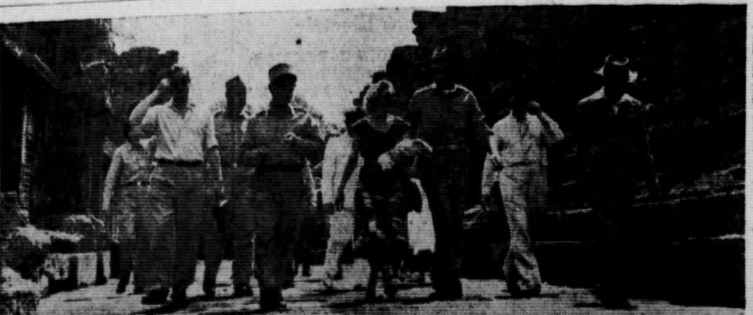
TOUCHING THE PAST —A hatless, open-shirted General Mark Clark and his wife stroll through the ruins of the ancient city of Angkor Thom, Laos, in French Indo-China, during the UN Far East-ern Supreme Commander's tour of southeastern Asia. The kingdom ended in 1431.

A dairy foods demonstration will be held in Cisco at the First Methodist Church Saturday, April 25, at one o'clock. The demonstration will be for all 4-H Girls from Rising Star, Seranton, and Cisco.