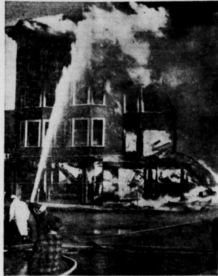
END OF THEIR HOMES —A stream of water jets up to a raging blaze in which 45 persons fled the building in Old Town, Me. Eleven families were left homeless and the damage was estimated at $100,000, despite the efforts of local firemen