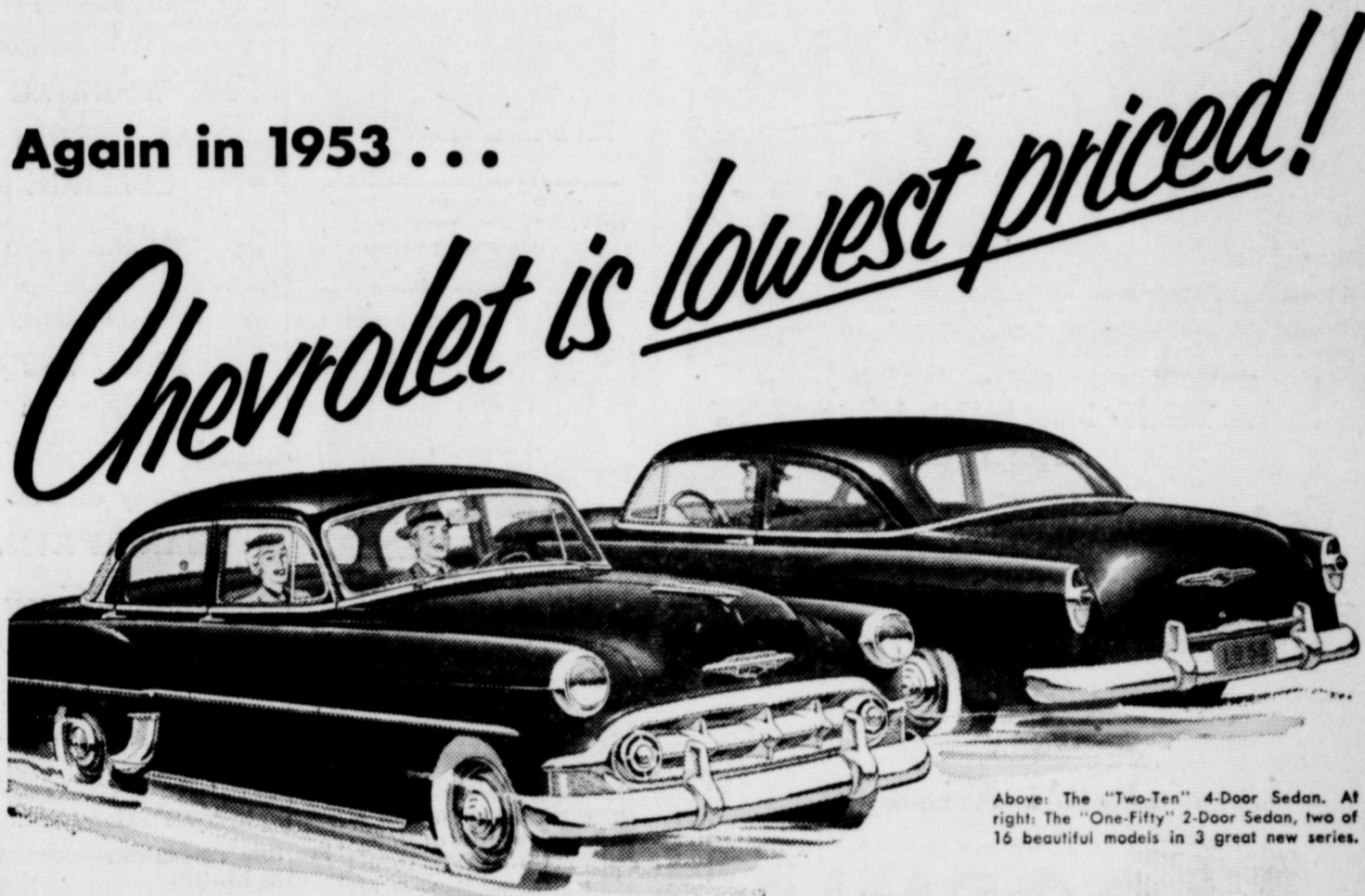
Above: The "Two-Ten" 4-Door Sedan. At right: The "One-Fifty" 2-Door Sedan, two of 16 beautiful models in 3 great new series.

It brings you more new features, more fine-car advantages, more real quality for your money ... and it's America's lowest-priced full-size car!