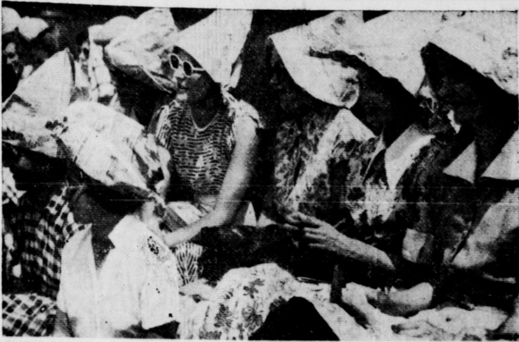
WARM WEATHER HEADGEAR —A group of girls attending a tennis match in London, England, seek relief from the hot Summer sun with hats created from newspapers. When others in the stands saw them, the fashion caught on rapidly, which meant a lot of new business for newsboys.