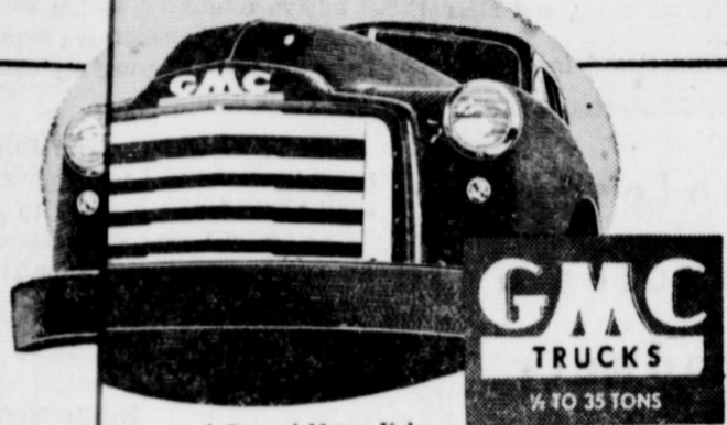
A General Motors Value