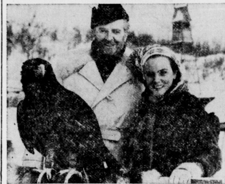
"Valley of the Eagles," regarded as one of the year's most spectacular films, will be shown Sunday, Monday, and Tuesday at the Palace Theater. Jack Warner and Nadia Gray co-star in this production of the perilous Arctic.