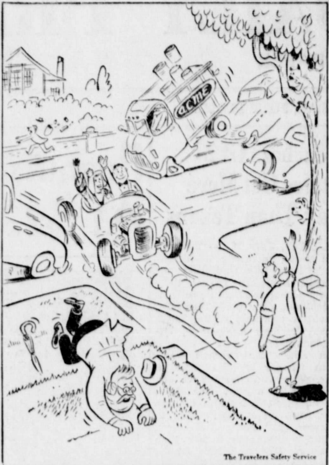
Lucky you—you impressed your friends without killing them