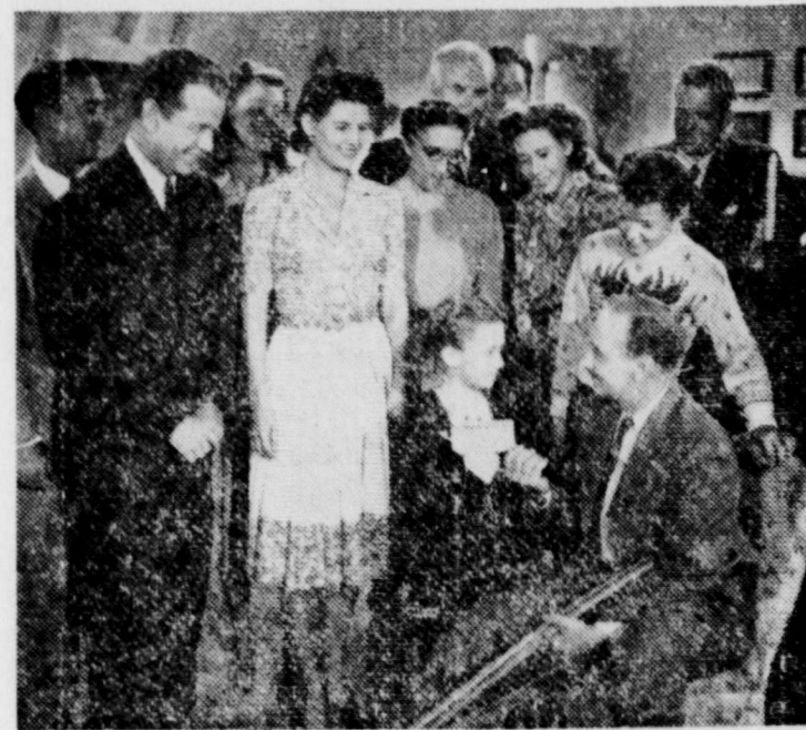
A scene from "Reathing From Heaven," which will be shown Thursday, Friday and Saturday at the Joy Drive-In, is pictured above. The highly recommended film has been called "something new and exciting in movies."