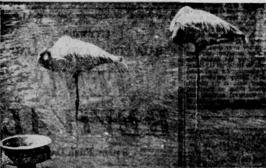
HIGH ON THE FOOT —An American and a Chilean flamingo demonstrate the art of relaxing while standing on one leg in a pond at the Bronx, N. Y., Zoo. With their heads buried under their wings, the graceful birds can snooze undisturbed by daylight or noise.

Plymouth-Chrysler Sales & Service Moran, Texas - Phone 138