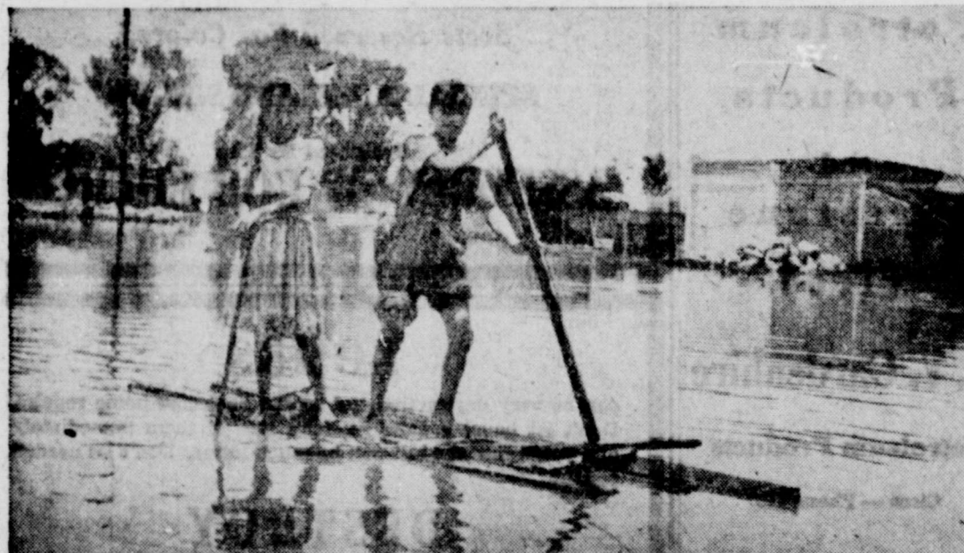
MORE FOR PLEASURE THAN BUSINESS —After recent heavy rains flooded some streets in outlying districts of Mexico City, two enterprising young people made a "water taxi" of boards and slats. While they offered to ferry people to dry land for one peso, there is no record that the youngsters got rich on the money they made from their small craft.