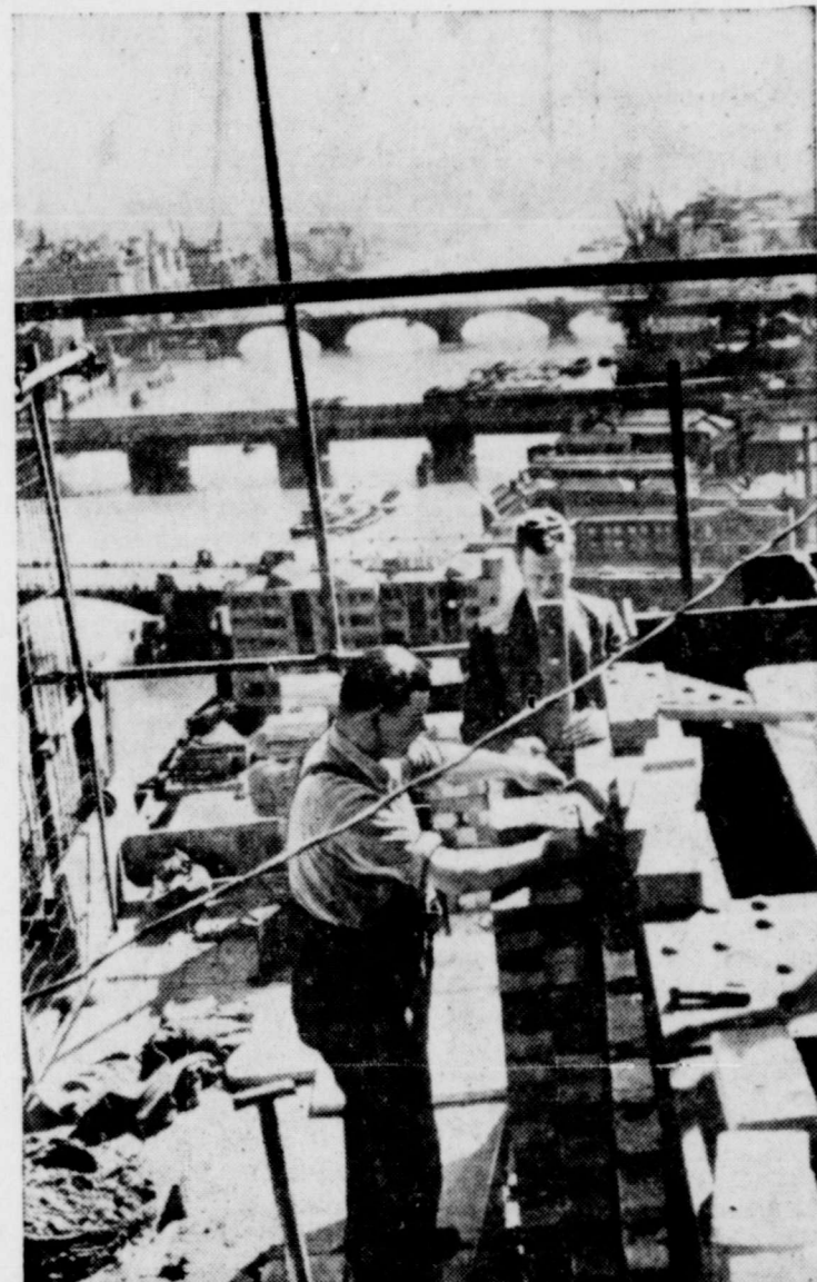
WORKING OVER THE THAMES—Far above the banks of the Thames River in London, an English bricklayer goes about his work on top of a chimney. From foreground to background, the bridges are: Southwark Bridge, Cannon Street railway bridge, London Bridge, and, seen dimly in the haze, Tower Bridge, located near the city's historically-famed Tower.