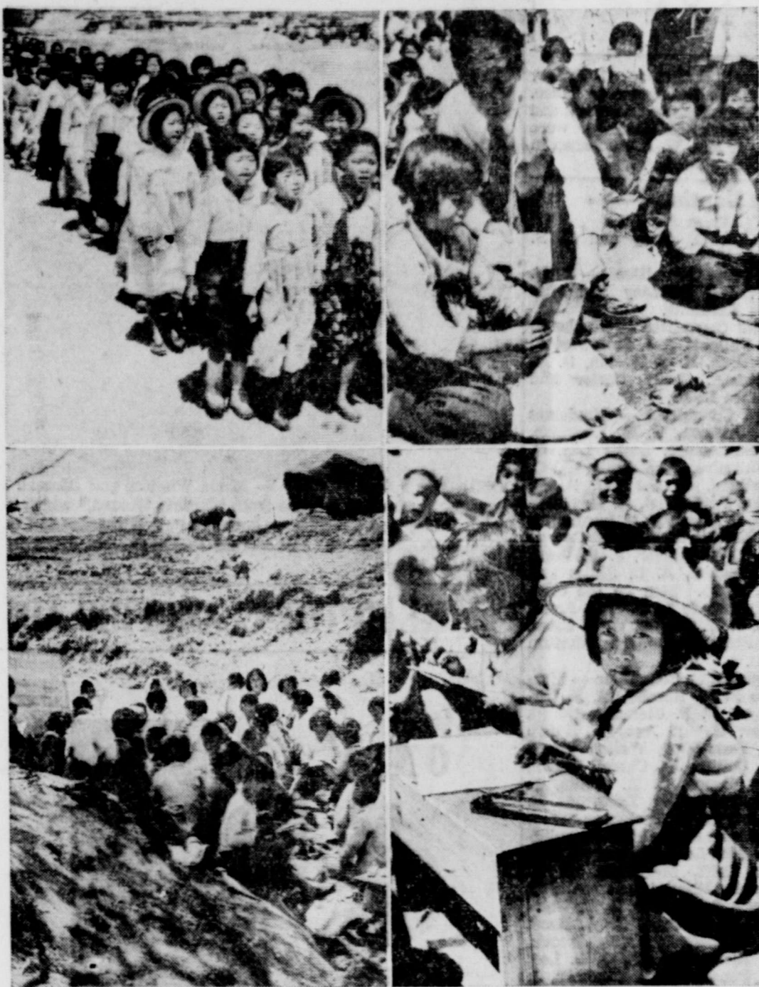
IT CAN'T BE STOPPED—Without a schoolhouse or adequate supplies, the village of Kunchon, Korea, continues the education of its children. At top left, a column of youngsters heads for an open-air class and, right, a teacher gives some instruction to one of his pupils. Classes are held in the shade of an almost bare tree, lower left, while some planking serves as a blackboard for written lessons. At right, a little Kunchon girl has an improvised wooden desk, but most of the other students use their knees while writing their studies.