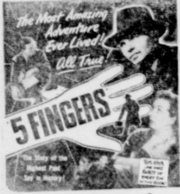
DAMES MASON DANIELLE DARRIEUX MICHAEL RENNE