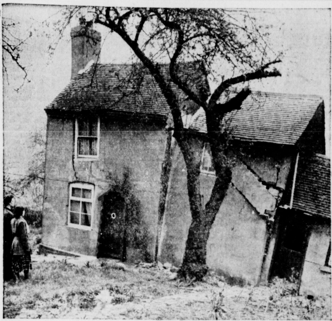
DOOMED! —A couple looks sadly at a cottage which has been split in two by the moving earth at Jackfield, Shropshire, England. This small community of 700 inhabitants is slowly being destroyed. Clay quarries on the hillside above the village were abandoned in 1940 and have filled with water. Since the weight of millions of gallons is forcing the hillside off its base of rock, roads, railway tracks and homes are being washed away.