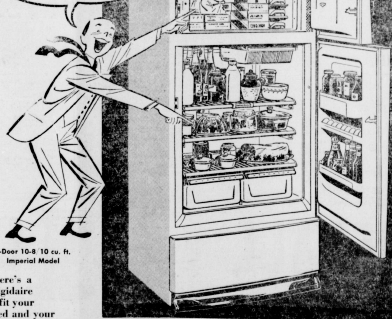
2-Door 10-8 10 cu. ft. Imperial Model

The giant food freezer alone holds 73 lbs. of frozen foods