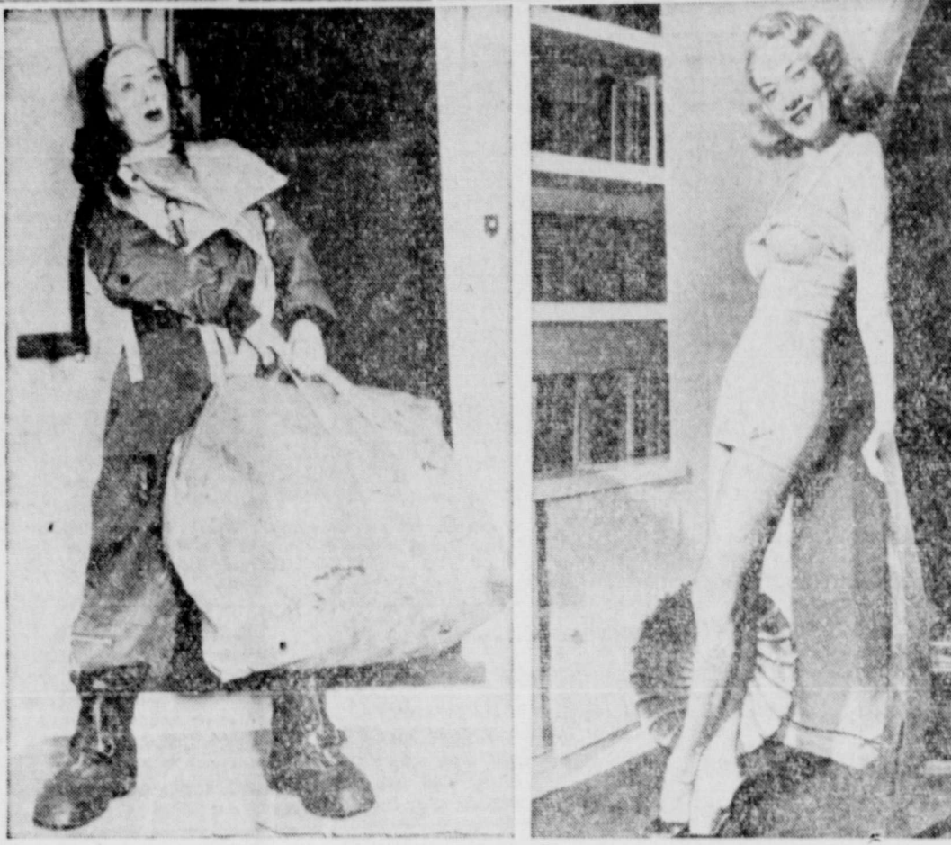
DON'T JUMP TO CONCLUSIONS —Bundled in flight togs for a tour by air of the Armed Forces overseas, shapely—you'd never guess it—actress Audrey Totter lugs her belongings in a traveling bag that isn't glamorous, left, in Hollywood. But the curvesome blonde took time out, right, to reveal what the boys might be treated to if that flying suit got too hot.

The diagnosis, coronary heart disease, refers to those vessels around and through the heart muscles and this disease is one of the leaders of heart trouble. It is in the coronary arteries that coronary thrombosis, angina pectoris and many other familiar heart disorders may wreck their havoc.