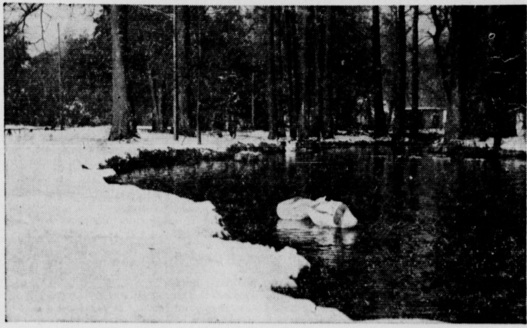
VERY UNUSUAL WEATHER—Two Royal swans in the lake of the Milan, Italy, Zoo pay little attention to the eight inches of snow covering the surrounding park. Most Milanese were astounded by the record snowfall, but the graceful birds accept it rather casually.

DRIVE AN OLDSMOBILE Before You Buy! Osborn Motor Co. — Eastland