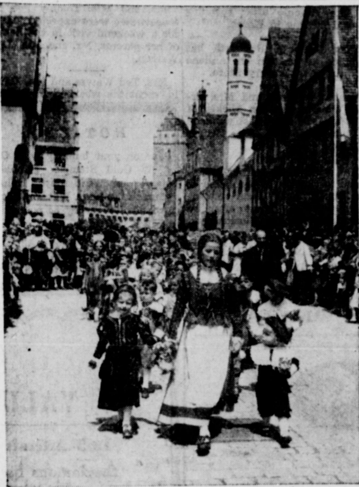
SOMETHING TO CELEBRATE —During the Thirty Years War, when the medieval town of Dinkelsbuehl, Germany, was threatened with destruction, it was saved by one of its women inhabitants. The fortunate event is celebrated each year by a pageant in which costumes of the period are worn as shown in this photo.