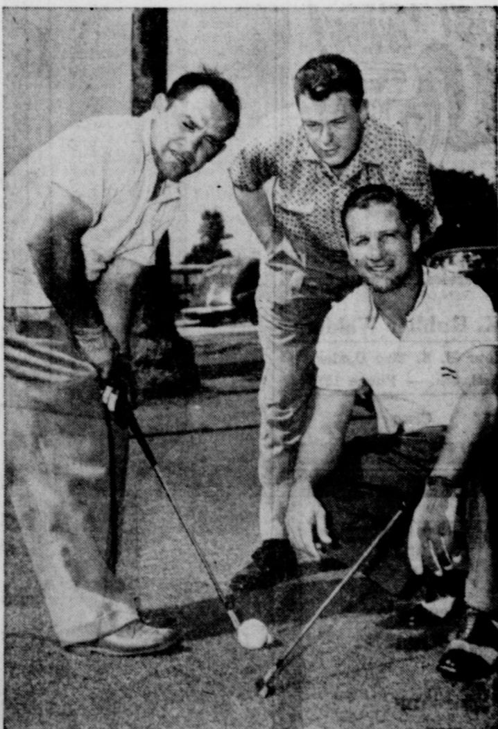
CLOWNING UP HIS GOLF —Cutting up a little at the Baseball Players Golf Tournament at Miami, Fla., Yogi Berra of the New York Yankees lines up on a baseball with his putter. Dick Wakefield, center, and Al "Flip" Rosen, of the Cleveland Indians, go along with the gag as they rest during a qualifying round of the tournament. Yogi certainly knows what to do with a baseball, so these results may have been startling.