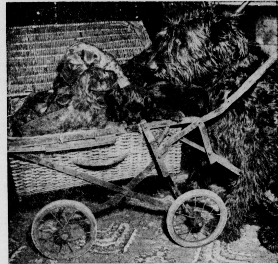
CHEAPER BY THE BAKER'S DOZEN —A canine mother in Paris, France, is contemplating her litter of pedigreed "Briard" pups after giving birth to 13 of them. Two having died of suffocation, the mother now contents herself with caring for the remaining 11. The father is a renowned champ in European dog shows.

A poster put out by the Department of Public Safety shows that each auto must be thoroughly inspected. The inspection will cover the following points: