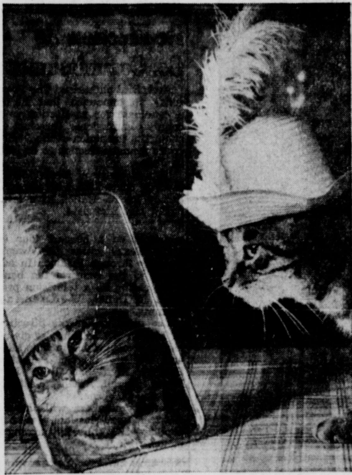
STARTING A TREND —An upturned brim, high crown and flattering plumes are features of this new cat chapeau, displayed in Paris by feline model, Miquette. Naturally, in the French fashion center, even pussy cats want to be up-to-the-minute in style, and wearing a smart hat like this is just the thing to give them the biggest thrill of all their nine lives.

Names ..... Phone ..... Address ..... City ..... Bill Bledsoe — Phones 399 or 479 1302 Ave. N. — Cisco