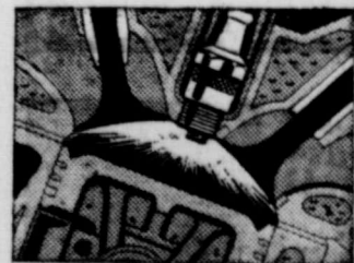
HEART OF FIREPOWER This hemispherical combustion chamber, with big, well-cooled valves right in its dome-shaped top, is the revolutionary reason FirePower outperforms all previous engines... even on non-premium grade gas!

YOU'LL HAVE TO DRIVE a Chrysler to learn the great difference the mighty new Chrysler V-8 engine has brought about! No words can ever tell you its magnificent response to your wish, the wonderful sense of its power in reserve, the complete new command of travel it lets you feel... and all of this on non-premium grade gas! We invite you to try this engine... and also discover the new safety and ease of America's first hydraulic power steering and Chrysler power brakes... at your early convenience!