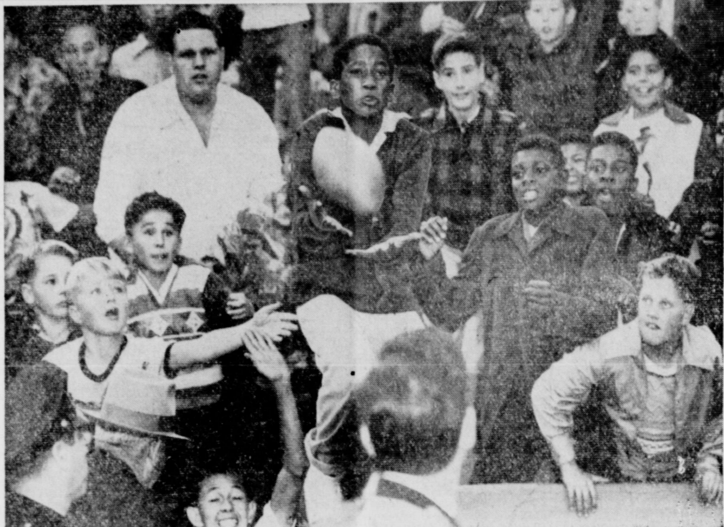
ALL IN VAIN—Eager to get a souvenir football, an unidentified boy in Los Angeles leaps from the stands to make a mid-air catch during a game. Despite the protests of the fans, the officer, lower left, returned the ball to the playing field.

A Break For The Hard of Hearing for a limited time we are offering a liberal discount on all new and used Hearing Aids. Also Liberal Allowance on Trade-Ins. De ARMOND'S Hearing Aid Center 700 Ave. G. Cisco, Ph. 877-J