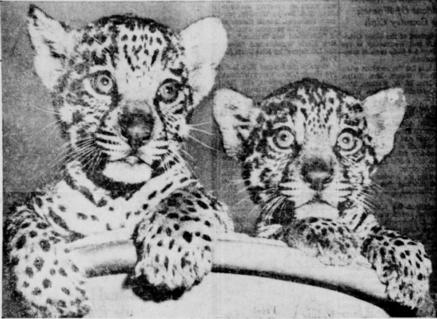
SEEING WHERE THEY'RE GOING—Two six-week-old jaguar cubs got their eyes full of the United States as they arrived at the Philadelphia, Pa., Zoo from Colombia, South America. They weighed a mere five pounds each, but after three years of hearty eating in this country, they'll both weigh in the neighborhood of 200 pounds.