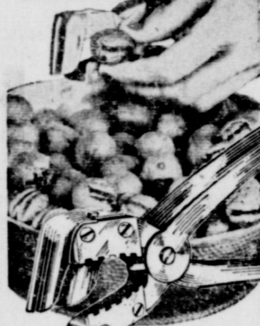
A Sheller... Not a Cracker

For pecans, English walnuts, hazel nuts, Brazil nuts, almonds and others. Just clip off the shell — out comes the whole nut. Beautiful polished aluminum handles with steel cutting blades.