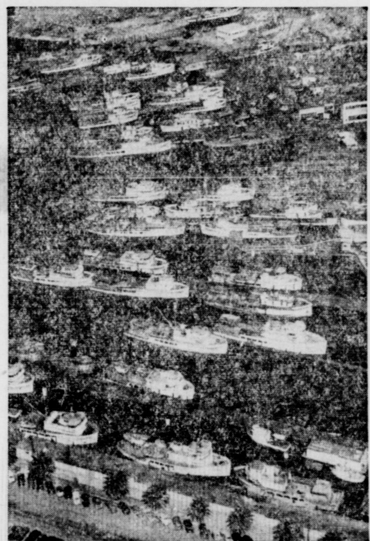
AMERICANS MUST WAIT—Scores of ocean-going tuna boats, idled by the heavy imports of frozen fish from Japan, are tied up at San Diego, Calif. Many of them have waited for weeks to unload their cargo. Beached by foreign fish, these boats, on a rotation schedule, must wait up to 90 days before returning to sea.

Widely known in music circles, Dr. Bedford's choir will present a varied program — from the great works of Palestrina to arrangements of negro spirituals set in modern idiom.