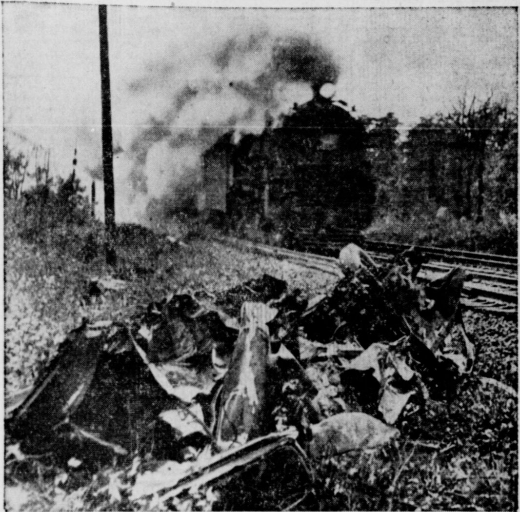
GRIM REMINDER—A train hurtles past the remainder of an auto which was demolished near Lindenwold, N.J., when it was hit by an Atlantic City-to-New York train. The driver of the car, a mother of three children, was hurled 78 feet in the fatal crash.