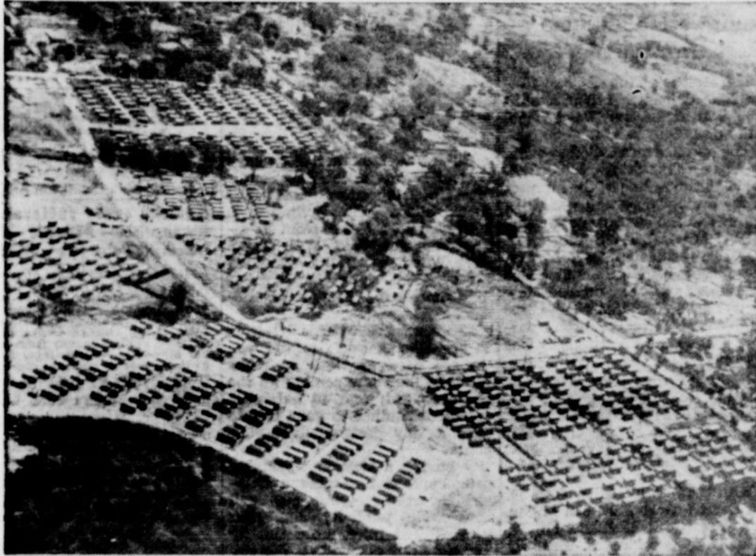
TEMPORARY SHELTER —Here's an air view of the Old Homestead golf course at Kansas City, Kans., where some 650 trailers have been set up to help ease the terrific housing problem created by the July floods which drove thousands of persons from their homes. More than 1400 applications for temporary housing have been received by city commissioners in the ruined metropolis.