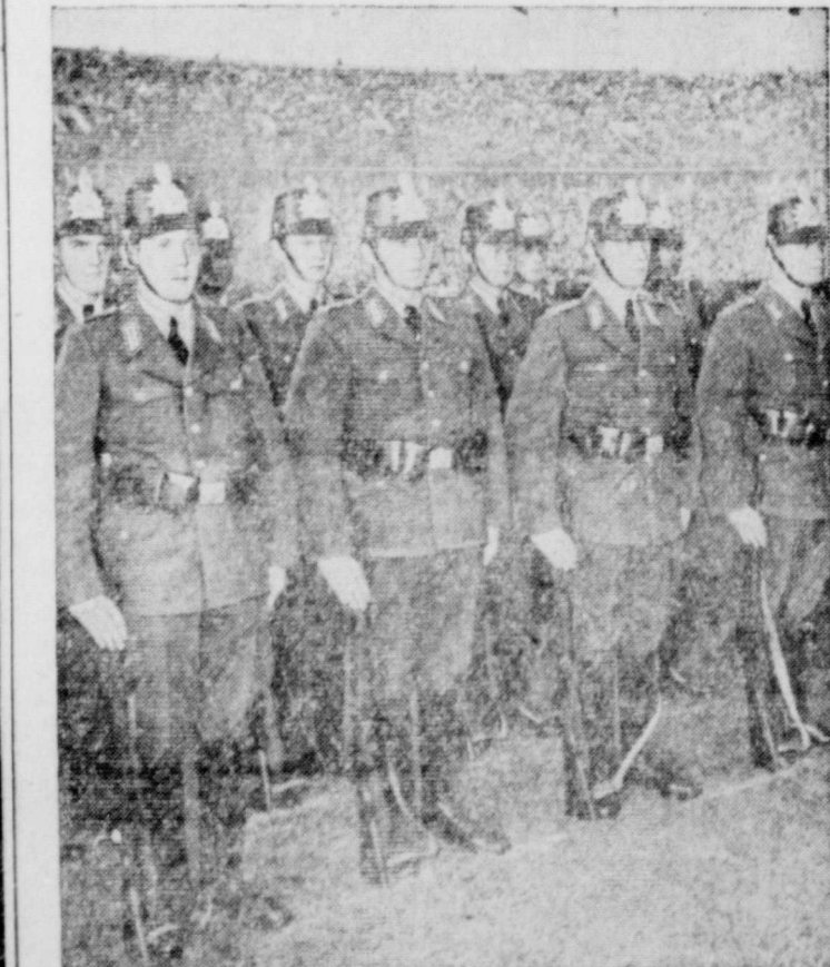
DEBUT—Members of the core of a new 3000-man West Berlin police force are standing at attention at a sports festival in the British sector of the city, making their first public appearance. The purpose of their organization is to quell any future Communist riots, and an appeal will be made for additional volunteers.