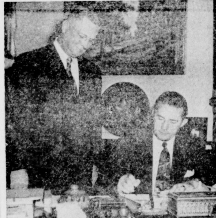
Official recognition came to the Texas oil industry today in the form of a proclamation issued by Governor Allan Shivers designating Oct. 14-20 "Oil Progress Week" in the Lone Star state. In this picture, Shivers signs the proclamation as Roy M. Stephens, Texas chairman of the Oil Industry Information Committee, looks on.