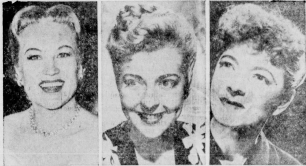
IT'S NOT TRUE —Blonde actress Pamela Britton, center, above, maintains in Hollywood that the popular belief—that blondes are not too brainy—is a fallacy. Pamela has played "dumb blondes" on the stage and in films, but to prove her statement she has named a lot of successful blondes including opera star Dorothy Kirsten, left, and actress Helen Hayes, right, above.