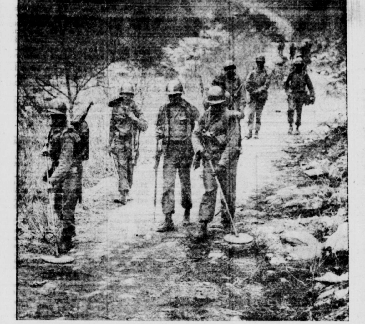
CLEANING UP—Members of a U.S. combat engineers battalion sweep up a winding trail for mines and booby traps in a rugged mountain area on the central front in Korea. This sector is held by British troops.