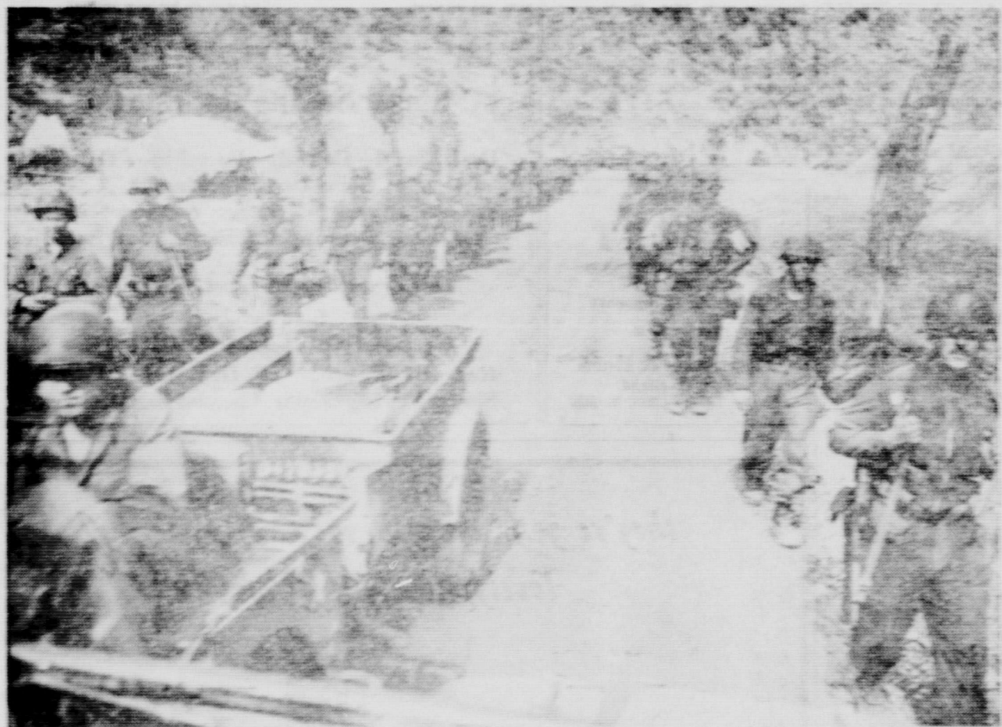
ALWAYS GOING SOMEWHERE —Moving along to take an objective a few miles below the 38th Parallel in Korea, toughened combat infantrymen of the 1st Division flank both sides of the road. The center is left open for supply trucks and accompanying artillery, which lend much-needed support to the foot soldiers who depend on mobile units for support.