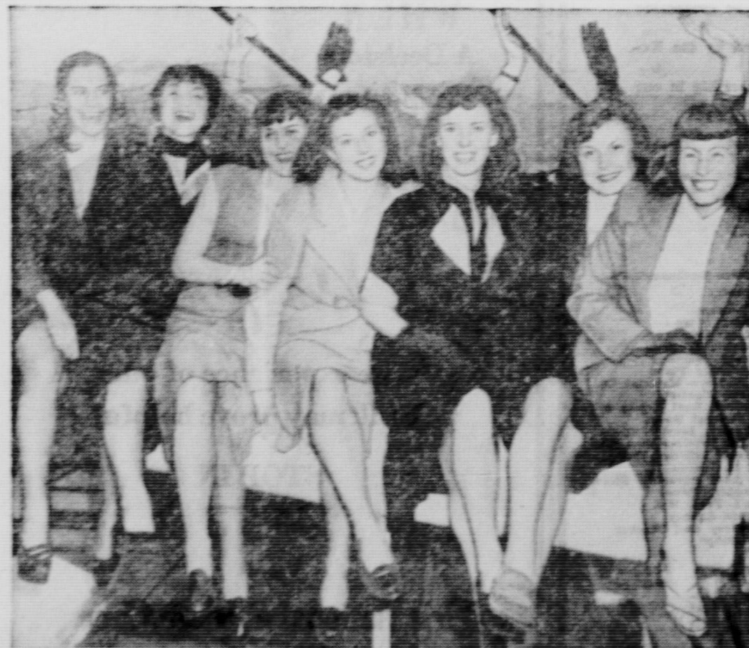
THEY'RE THE REAL THING —They're "can-can" dancers, right from Paris, posing for the photographer in New York as they arrived on the liner DeGrasse. They plan to tour the United States with their own imported version of the once-naughty, time-honored dance.