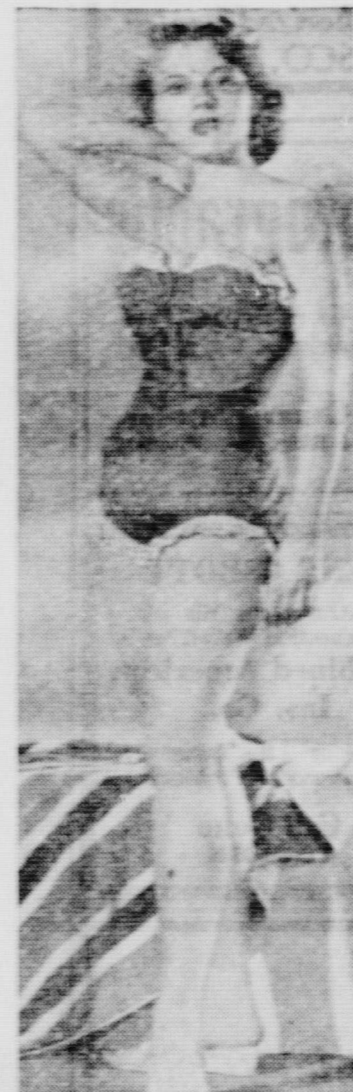
DEY AND SAFE —Starlet Peggie Castle is staying away from those California beaches. But it must be admitted that she's as shapely a gal as ever graced a Hollywood studio.