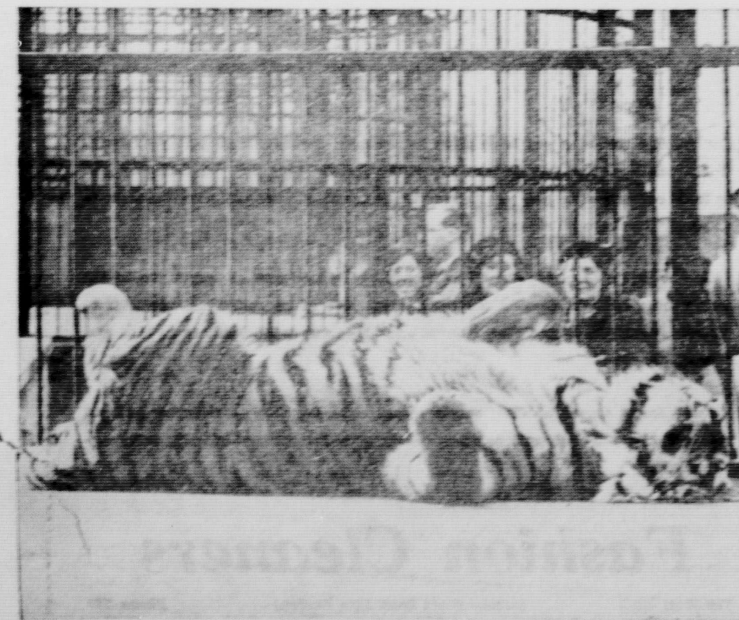
HAPPY TO BE ALIVE —Bocha, the Indian tiger at the London, England, Zoo, is suffering from the same disease that strikes most people at this time of year—spring fever. He's just feeling good, and a roll on the floor of his cage is a pleasant way to show it.