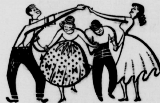
DANCING — 8:30 P. M.