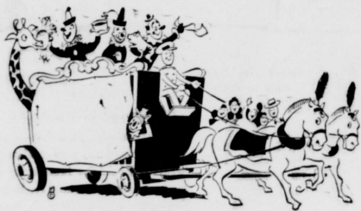
Big Parade — 11 A. M.