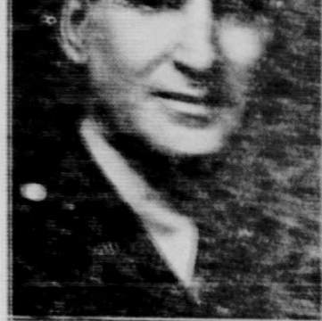
MAJ. GEN. IRVING

Anticipating the celebration of the sesqui-centennial of the establishment of the United States Military Academy at West Point in 1872, formal observance exercises of the 148th anniversary of the Act of Congress founding the Academy have been scheduled for March 16-17, this year. This will be the first of preliminary activities marking in the six-month celebration beginning January 1 which will be climaxed July 4, 1952.