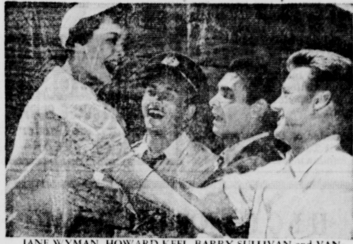
JANE WYMAN, HOWARD KEEL, BARRY SULLIVAN and VAN JOHNSON in MGM's "THREE GUYS NAMED MIKE."