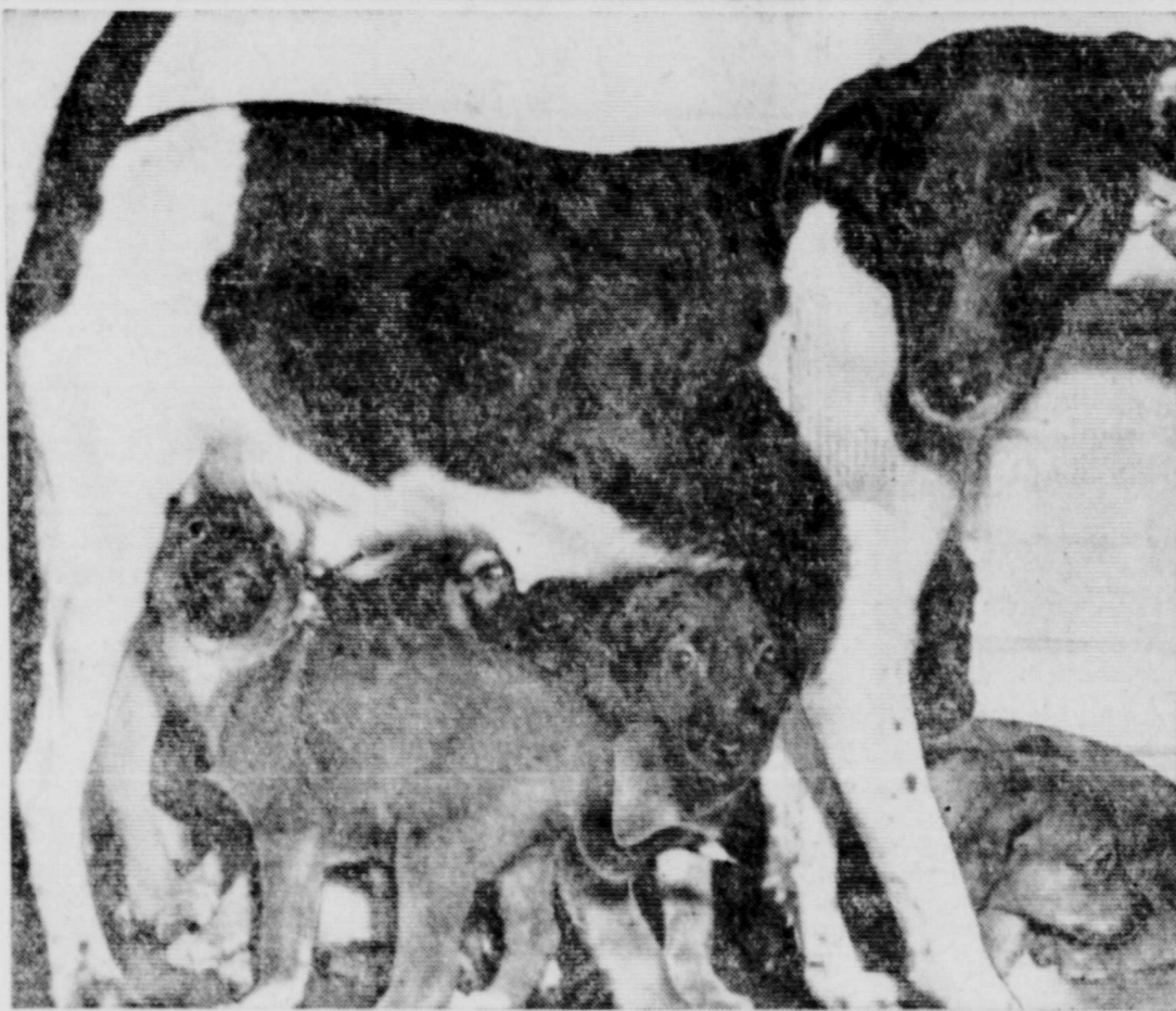
TROUBLEMAKERS —Six puppies gather for comfort around their mother after they were forcibly removed by the ASPCA in Philadelphia when they hampered firemen battling a blaze in their owner's home. To add to the general confusion, another puppy and four other dogs were also found in the apartment of their mistress, who was unavailable for comment.