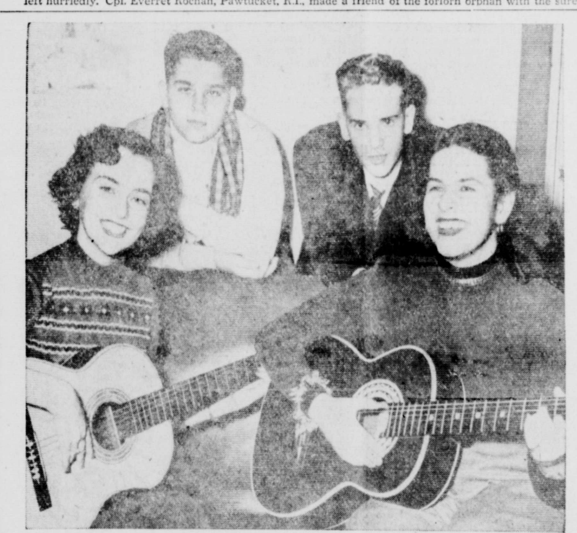
IN HIGH SPIRITS-An impromptu serenade is rendered by four young polio patients after their arrival at New York's Idlewild Airport from Brazil. All four, partially crippled by polio, will unlergo diagnosis and treatment at Bellevue Medical Center and they'll be there from four to six months. They're obviously pleased at the idea.