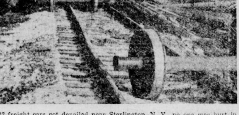
IN A TANGLE-Although 22 freight cars got derailed near Sterlington, N. Y., no one was hurt in the mix-up on the Eric Railroad. This view of the piled-up wreckage of the freight cars shows how widespread the damage was, and what a lot of people had to be thankful for.