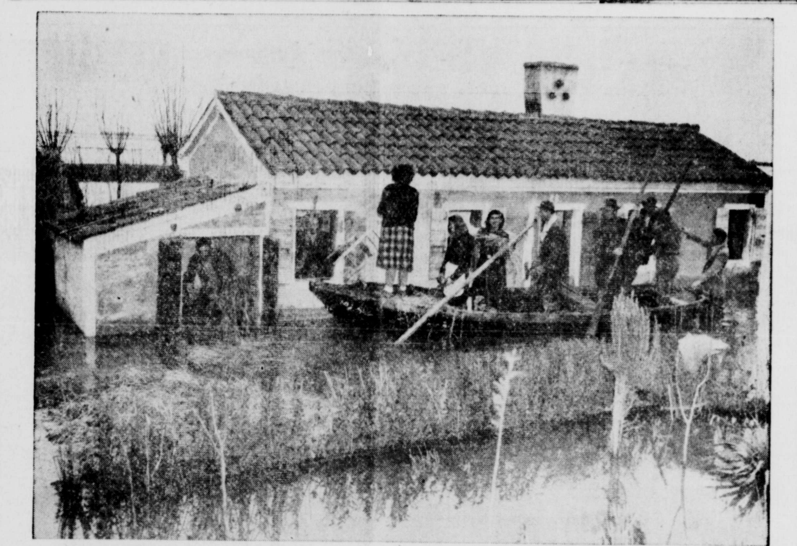
HOMELESS IN FLOOD-With the use of a river boat, members of a farm family near Chioggia, Italy, salvage their household belongings from a rising flood. More than 1200 acres of cultivated land were inundated in the area when a huge gap was broken in a protecting dike. About 100 families were forced to abandon their homes.