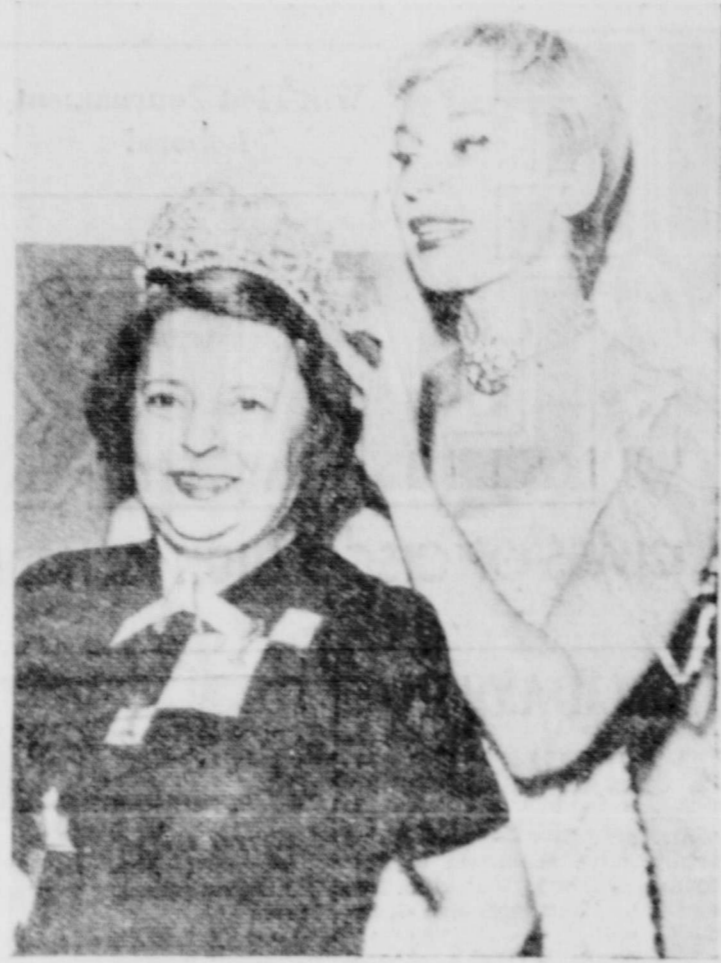
A LAUREL FOR LORELEI—Carol Channing, right, the current Lorelei Lee of the hit musical comedy "Gentlemen Prefer Blondes," tries her tiara on June Walker, in New York. Miss Walker was the original Lorelei back in 1926, when the musical about the flapper era was done as a straight comedy.