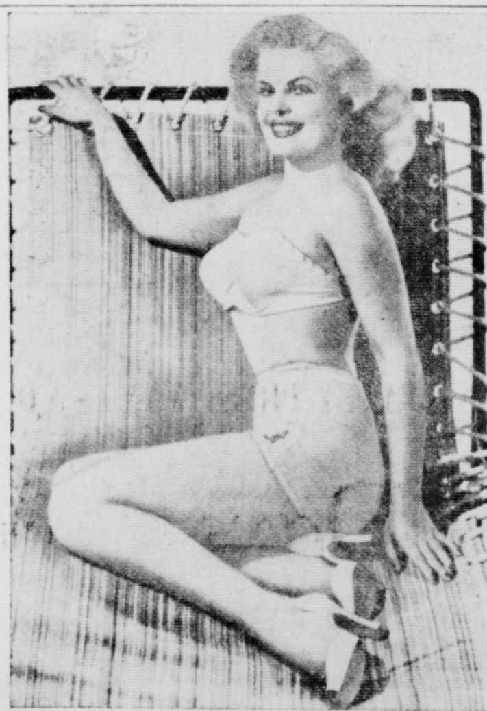
BEAUTY FOR CANVAS — Starlet Cleo Moore, in Hollywood, Calif., is something to send the old masters running for their canvas. She makes a picture against the back of a canvas chair, and even a proper frame couldn't do much to belighten her charms.