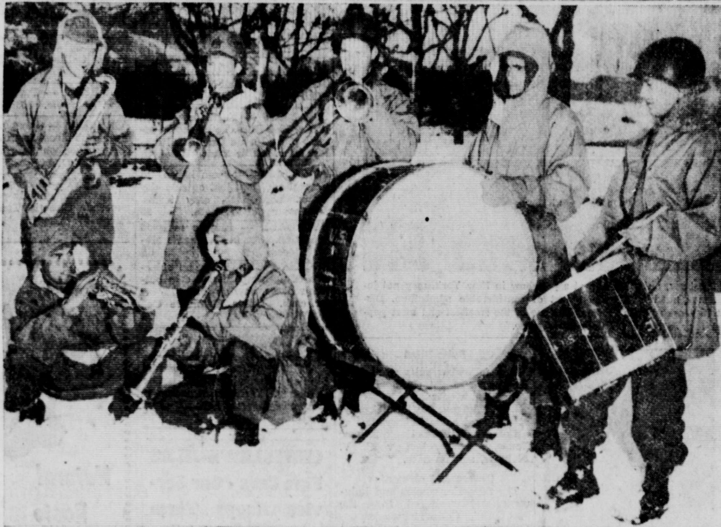
STRIKE UP THE BAND—Members of the 7th Infantry Division Band keep their instruments warm by practicing in a snowbound area of Korea. These handsomen, when not playing at ceremonies, go into action as a defense platoon on the division perimeter, so their army life is not just one long, sweet song.