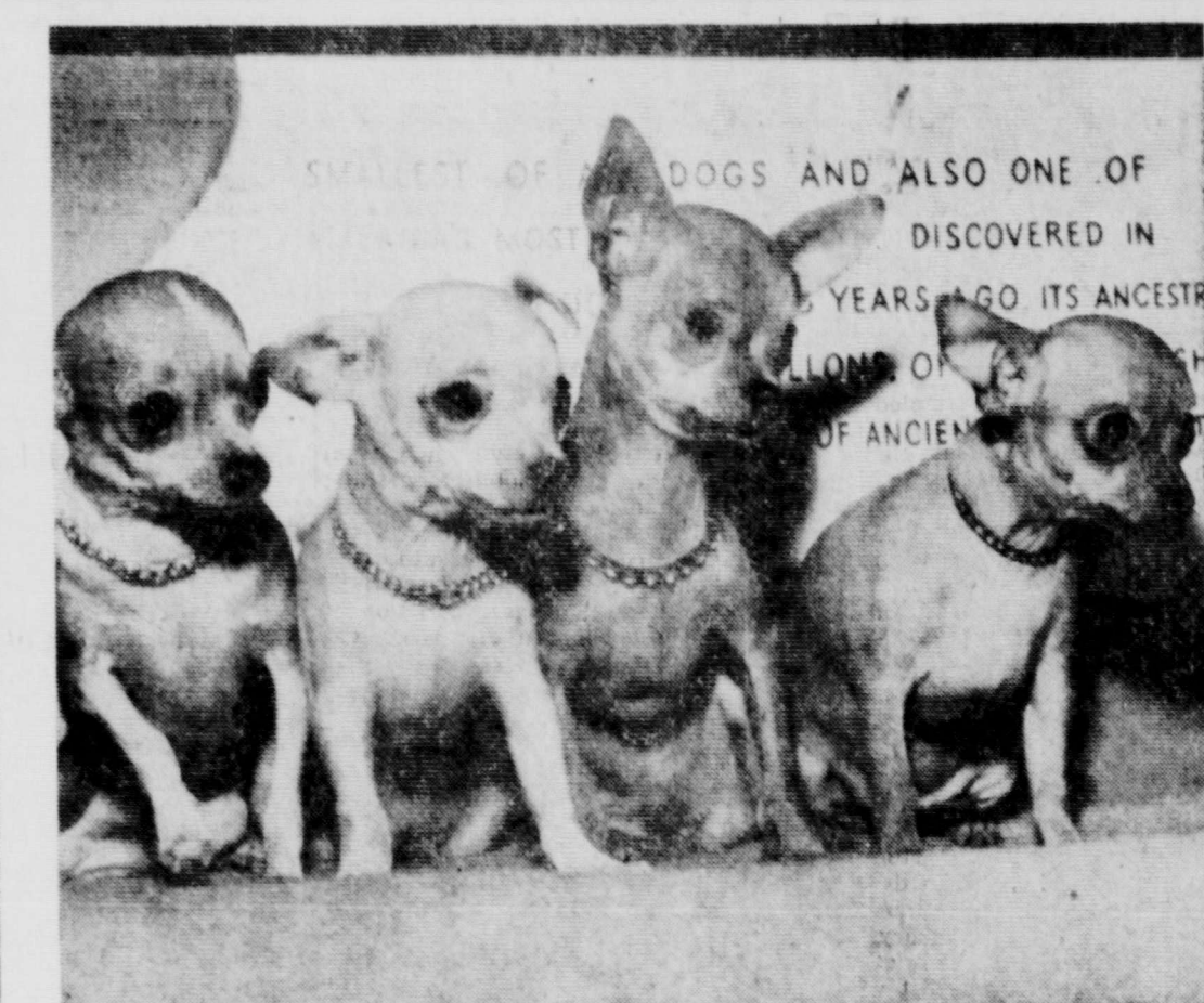
ALL LINED UP—These little Chihuahuas, on exhibition at a pet show in New York, may not inspire a feeling of terror in the audience, but they are the object of considerable admiration. Discovered in northern Mexico about 75 years ago, Chihuahuas are one of the smallest and most popular breeds, and they're noted for their intelligence.

The industry is winning by the margin of 2-to-1 in the race to replace exhausted wells with new producers. In spite of the vast consumption of recent years, our known proved reserves of crude are greater than ever.