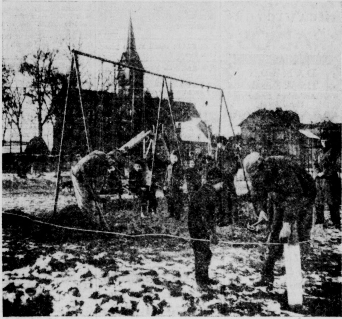
SWING SHIFT—American GI's in Hanau, Germany, put in some overtime and built swings on ten playgrounds for children of the area.

"It was one of the best years in Ford history, with production and sales breaking all company records of the past quarter-century," Mr. Ford said.