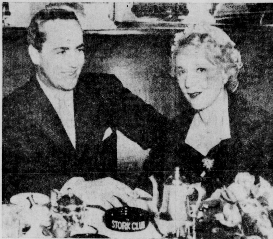
FAMILY AFFAIR —Mary Pickford, one of America's most famous actresses, is shown dining with her husband, TV star Buddy Rogers, at the Stork Club in New York. The fabulous "America's Sweetheart" has become one of the nation's top business-women since she retired from the screen.