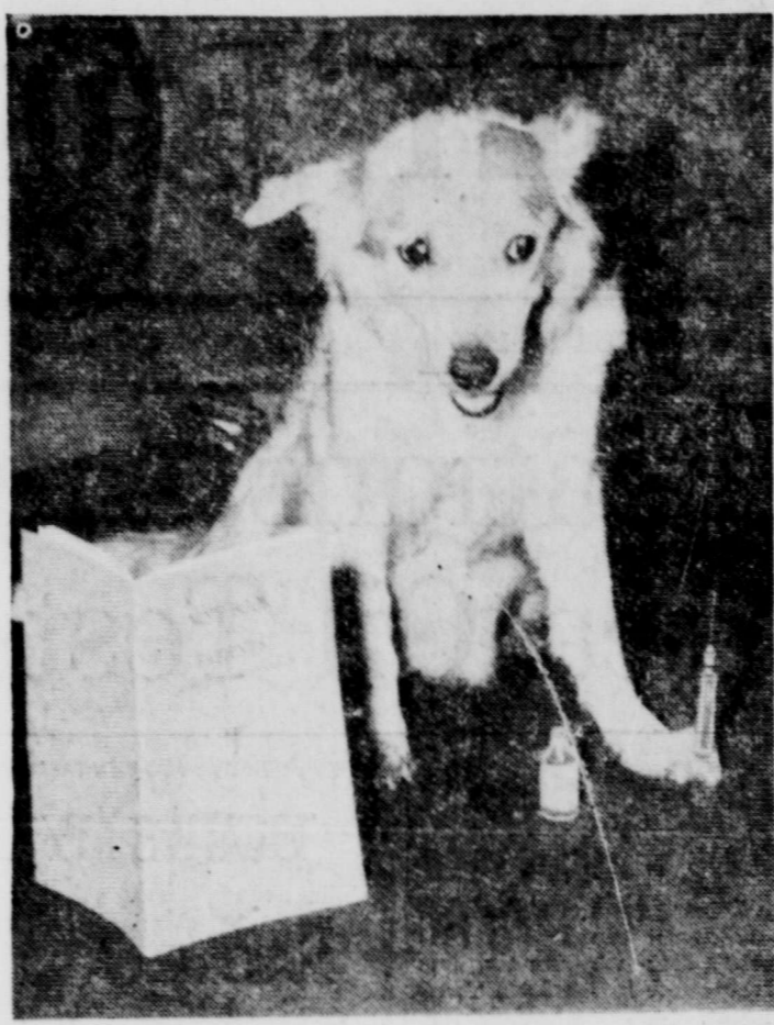
TAKING HER SHOT —Peggy, an 11-year-old toy collie, grips a hypodermic needle in one paw while reading how to administer her insulin shot in a Chicago, Ill., hospital. Peggy has diabetes, the second case of the disease in dogs in the hospital's history.