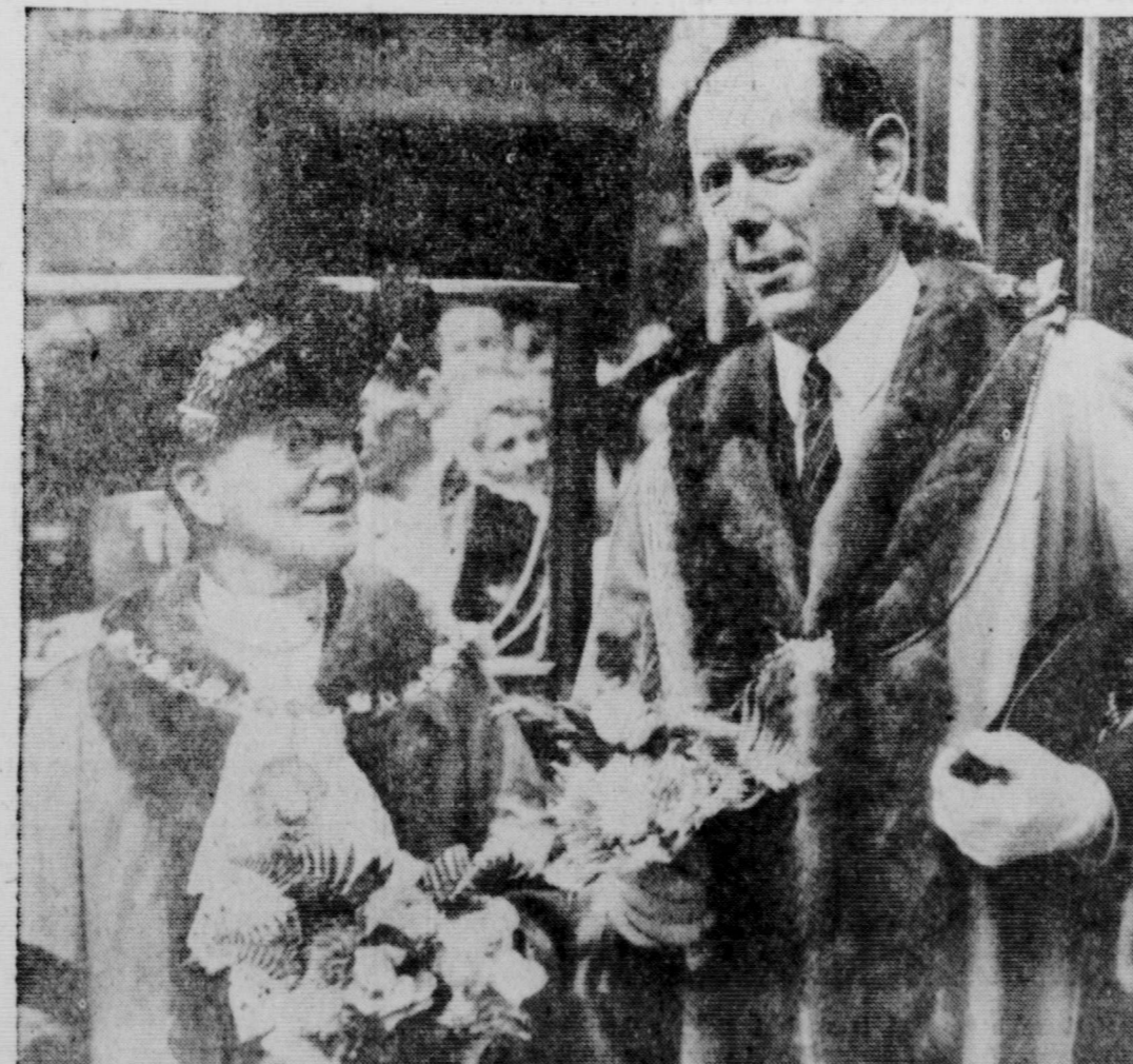
AN EVEN EXCHANGE—Sir Frederick Rowland, right, the old Lord Mayor of London, England, congratulates the new Lord Mayor, Denys Lawson, upon his election to the post. The two are shown leaving the Guild Hall in colorful official garb.