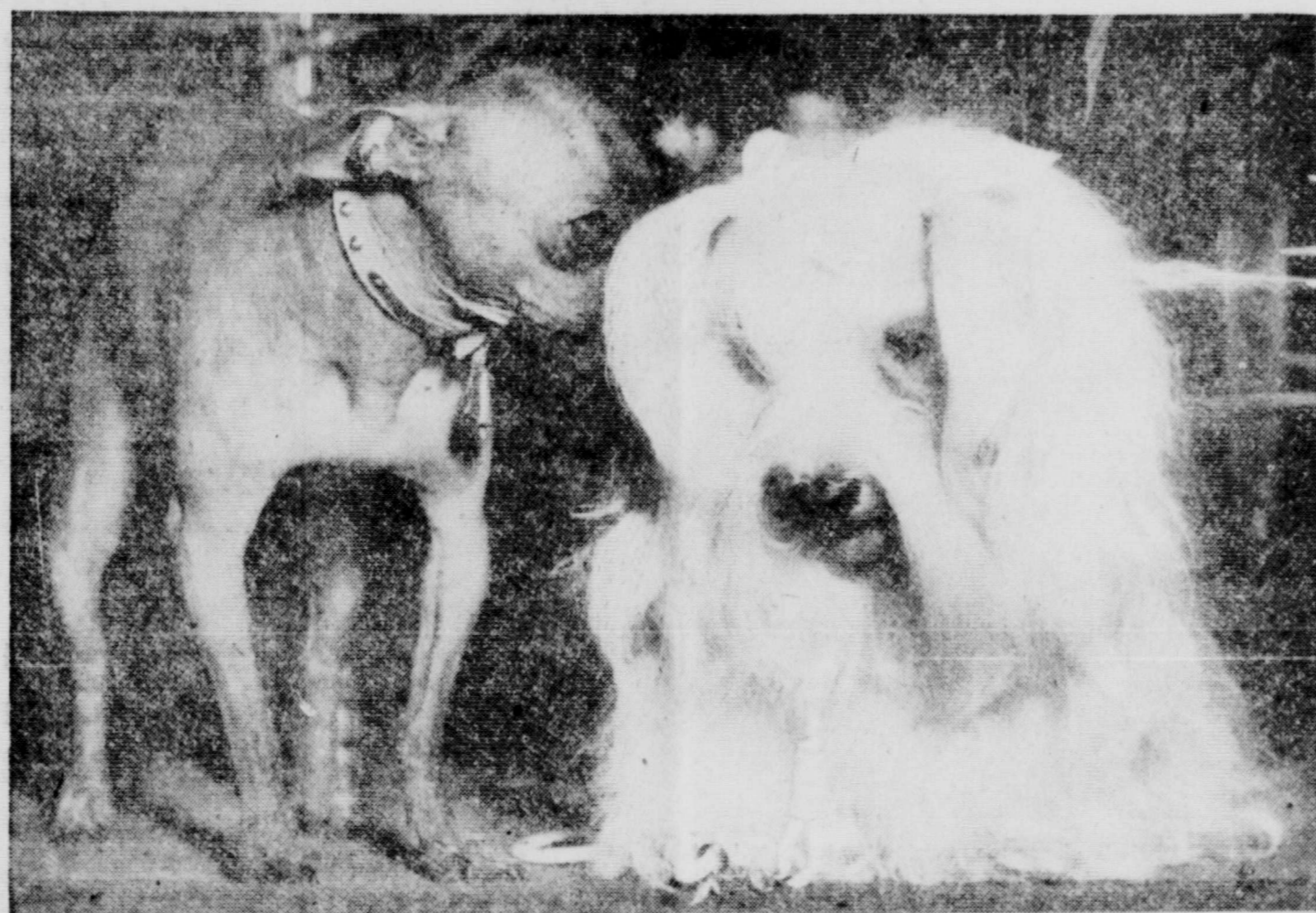
WITH AND WITHOUT—Djumbo, a five-year-old Mexican Hairless, has a word of flattery for Electa, a Maltese lap dog, during their appearance at the 23rd International Dog Show in Paris, France. The hairless and the hairy are champions in their classes.