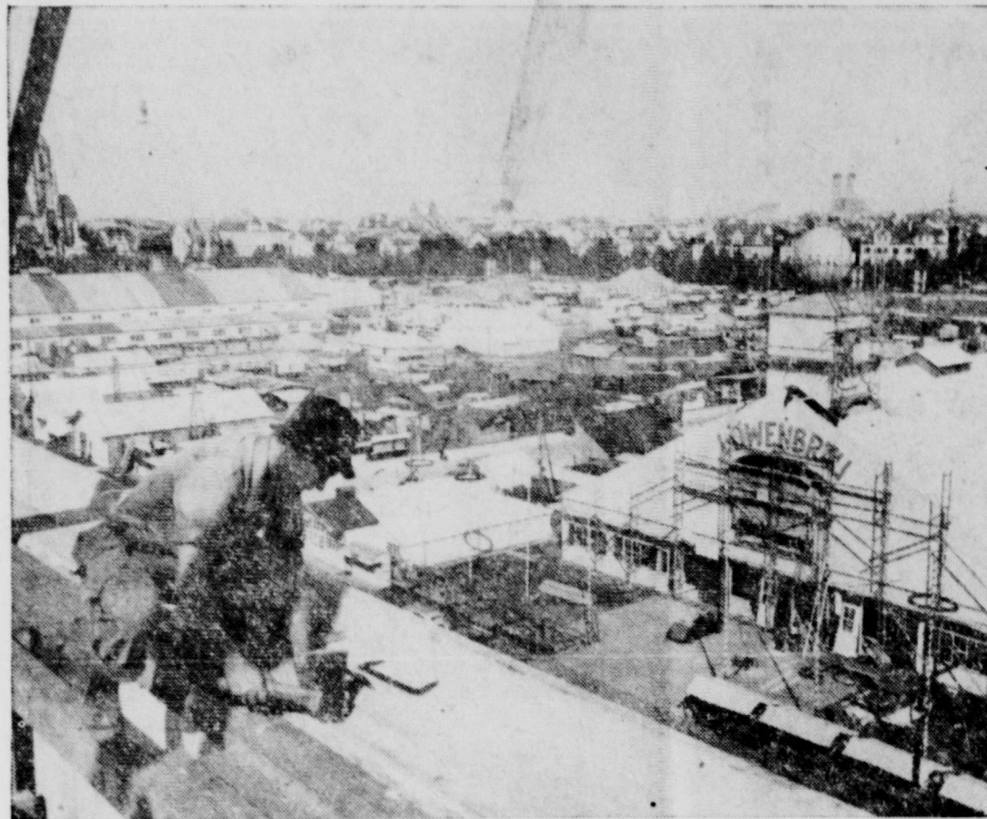
ALL OUT FOR FUN —Workmen are readying the traditional October Festival in Munich, Germany, by setting up merry-go-rounds, flying cars and beer tents. For the first time since the end of World War II, huge oxen will be roasted on an open fire. At the right is a beer tent.

a member of the faculty of Howard Payne College.