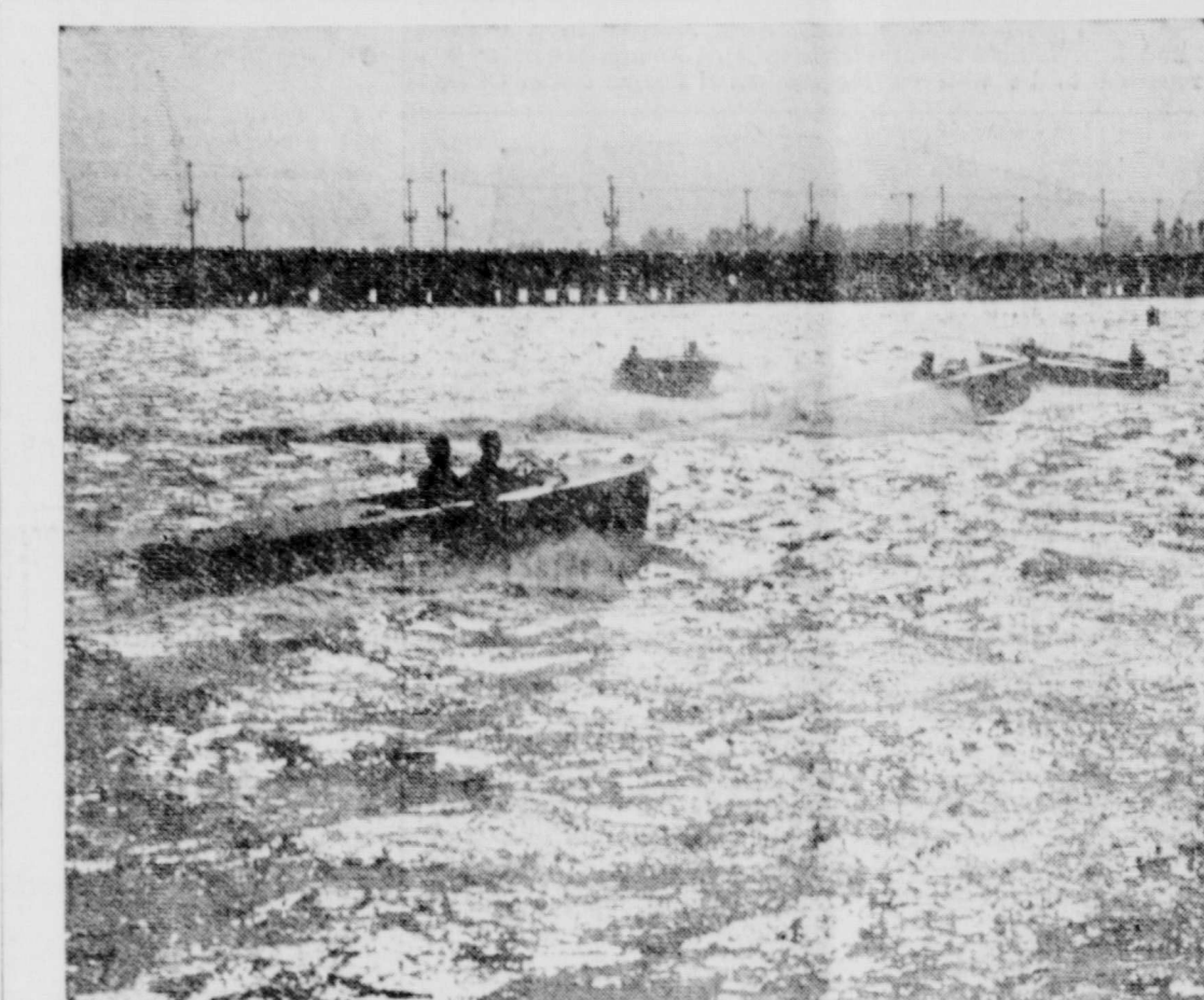
OVER THE WAVES—These motorboaters are having no difficulty in seeing as they enjoy skimming along in the bay at St. Petersburg, Fla. The bright moonlight is enabling them to see as well as they could during the day, so it isn't likely they'll bump into one another.