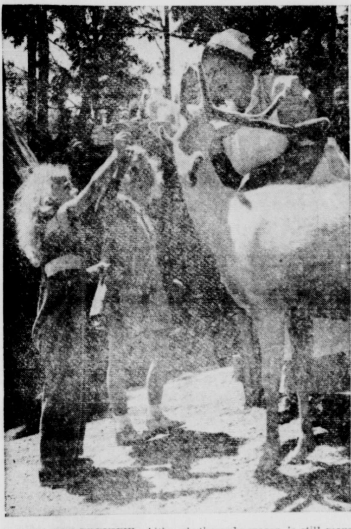
CHRISTMAS PREVIEW—Although the yule season is still many weeks away, youngsters can visit Santa Claus at a nearer North Pole; this one is on Whiteface Mt., near Wilmington, N.Y. The tots are helping Mother Hubbard feed a reindeer at Santa's workshop which has been visited by more than 500,000 children and adults.