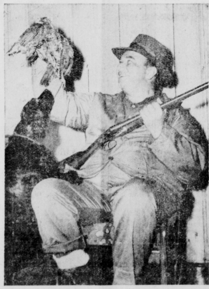
QUITE A HANDFUL—The partridges held by New York realtor William Zeckendorf in Mooselockmequantic Lake, Me., obviously weren't good at dodging his shotgun's blasts. Zeckendorf is reputedly after another kind of dodger—the Brooklyn Dodgers baseball team, and is trying to bag a quarter ownership.