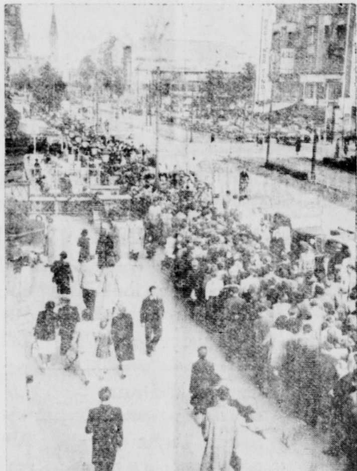
THEY WANT IN—A long line of Russian-sector Berliners wait their turn to buy tickets to a theater in the city's British zone. Only East Berliners, who had to show identity cards, were allowed to attend, and thousands took advantage of the opportunity.

ADMISSIONS SLASHED! BACK TO PRE-WAR PRICES! Children 50c — Adults $1.00 Reserved Chairs 63c Plus Tax