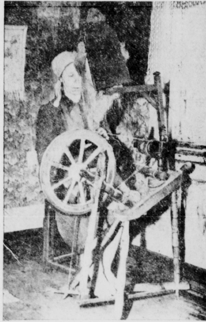
POLISH FOLK-ART —Weaving the traditional peasant costume, a woman of the Kurpie area, northeast of Warsaw, Poland, winds up yarn before her ancient spinning wheel. The Kurpie section boasts many skilled home manufacturers of the colorful, richly embroidered peasant dress.