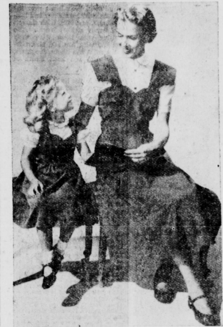
MOTHER'S LITTLE SHADOW —Mother and her shadow are dressed for the day's adventures in identical corduroy jumpers and white blouses. Shown in Sanford, Fla., the practical jumpers are finished with stay-put winged shoulders and back zippers which insure a more perfect fit.

Immediately after the ceremony a reception was held in the Woman's club. The bride's table was covered by an imported ivory