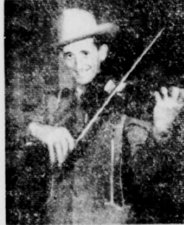
American Legion Hall ABILENE, TEXAS West Texas' Favorite Dance Spot