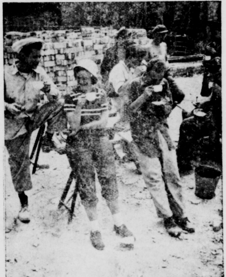
PITCHING IN—These students from the U. S., England, Holland, Switzerland, France, Denmark, West Berlin and from the Soviet zone, too, are helping to reconstruct Elizabeth Hospital in the British sector of Berlin. Work on the bomb-damaged building is being financed by the World Council of Churches.