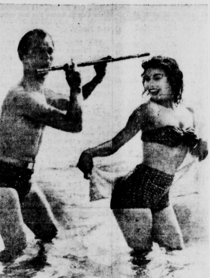
FEELIN' FINE —In Spain to finish her new film, actress Ava Gardner can't resist the music being made by Nigel Patrick. Ava's co-starring in the nearly-finished picture with James Mason and will soon be back in Hollywood after a lengthy European trip.