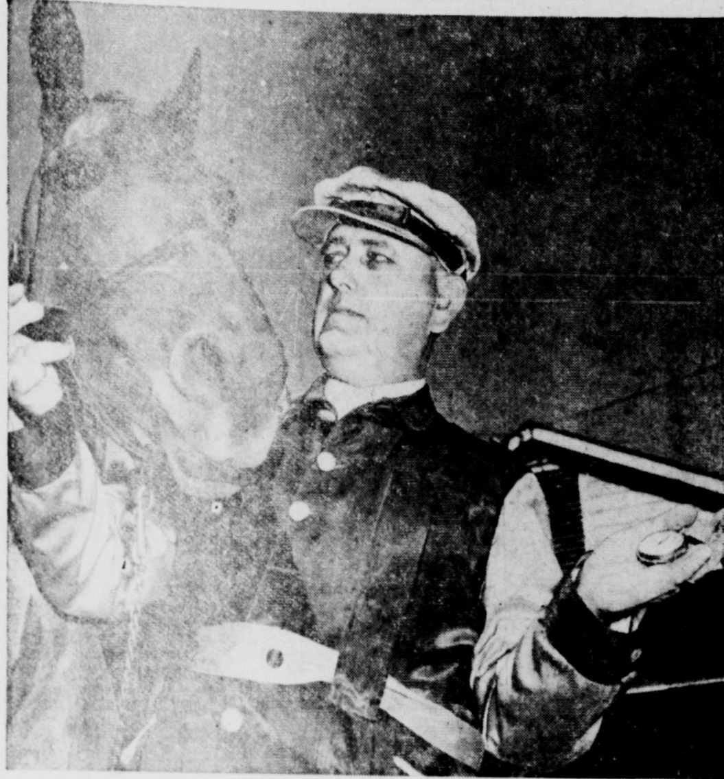
CLOCK WATCHER—Josedale Counter, nine-year-old trotter, makes a mental note of her time after a workout at the Yonkers, N. Y., Raceway...

"ROCKET AHEAD" with Oldsmobile Motor Company, Eastland